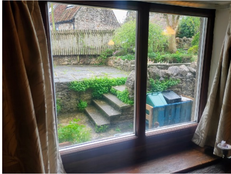
Living Room East