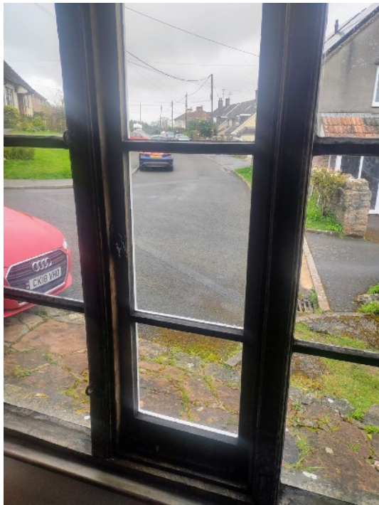
Living Room West 2 Original window