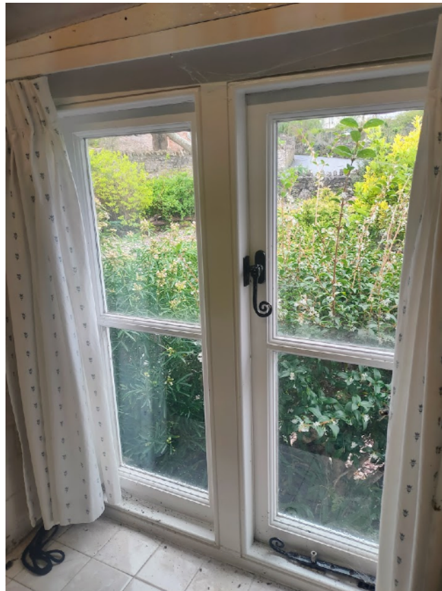
Boiler Room South