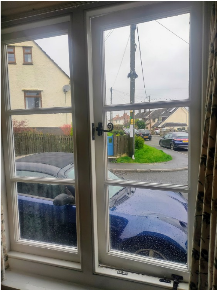
Living Room West 1