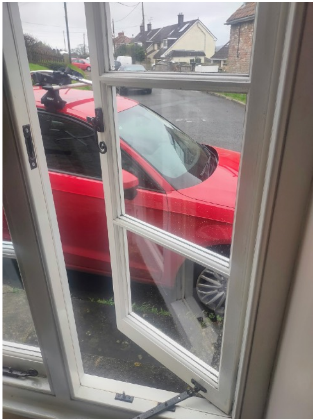
Living Room West 1, Detail Caption