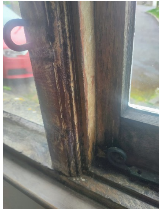
Living Room West 2 Detail