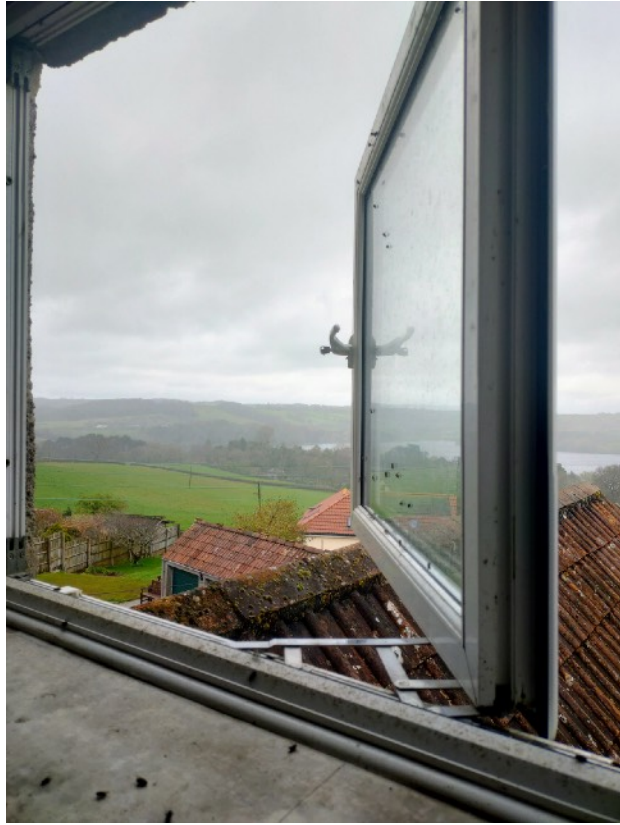
Second Floor UPVC Window