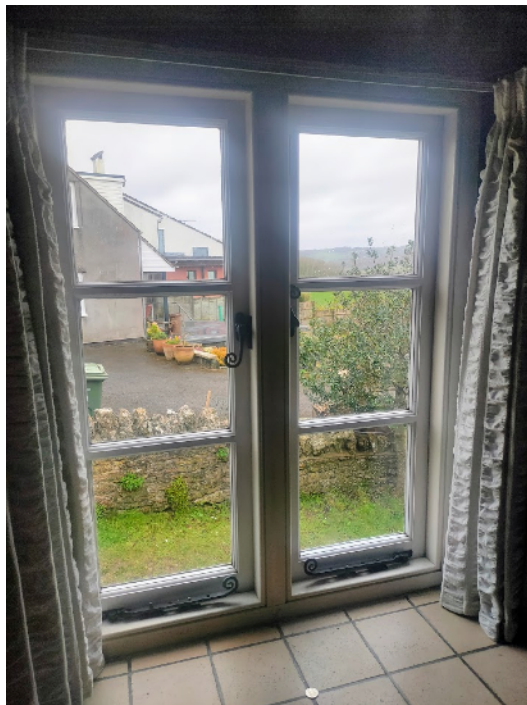
Dining Room Window 2