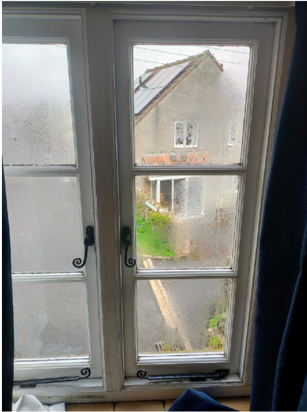
Bed 3 Note condensation