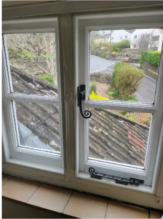
Bed 1 South