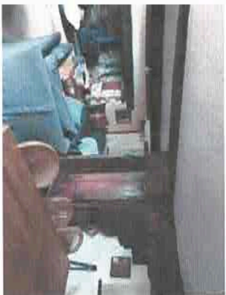
11. The sitting room with main stairs and fireplace