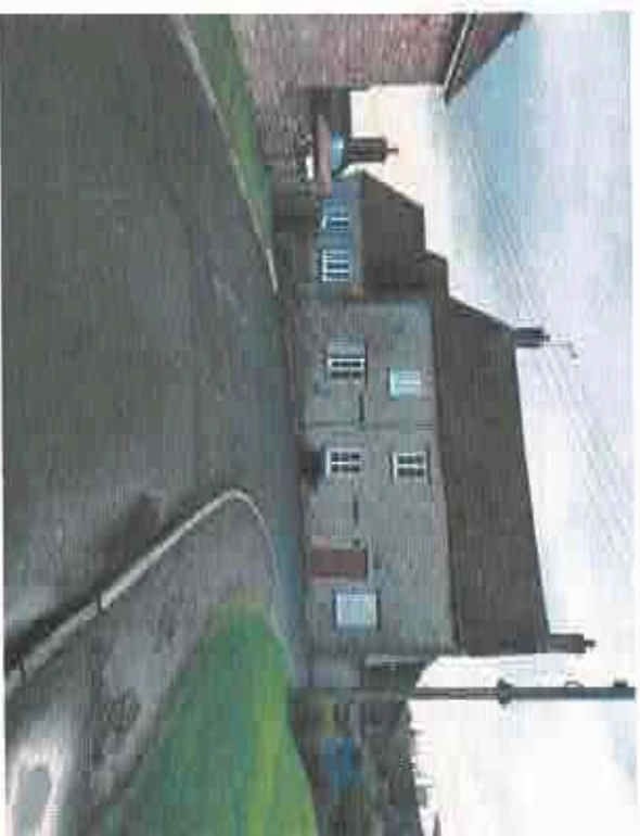
1. Walnut Tree House

Interior noted as having retained all original stop-chamfered beams and roof trusses with dove-tailed collars and morticing for in-line purlins. Open fireplace to left with wooden bressummer and 2 recesses to rear (one with cockshred hinges to door); solid-tread stairs rise from first-floor to attic above. Another solid-tread wooden stairs to rear wall, set into slight recess. C17 plank and batten doors with scribed edging and original wrought-iron fittings. Reset C17 pegged wooden doorframes. A well-preserved example of the 2-unit plan which became increasingly common from the later C17 in this area: many original interior features, the solid-tread stairs being particularly rare and notable survivals of a formerly common vernacular type.