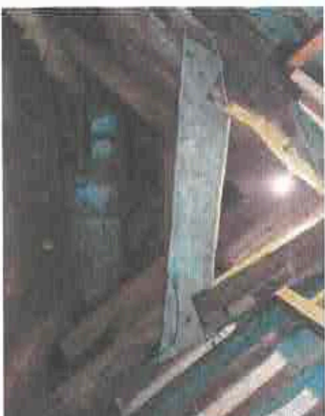
14. The main office with historic panicles and replacement common rafters