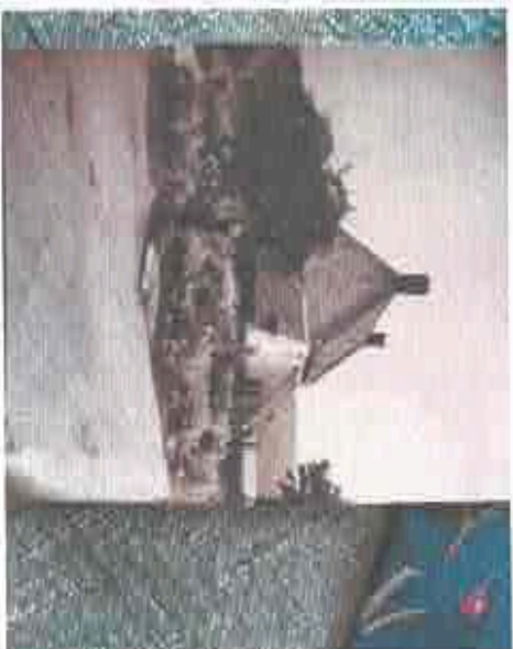
5. View of the property from the lane to the south