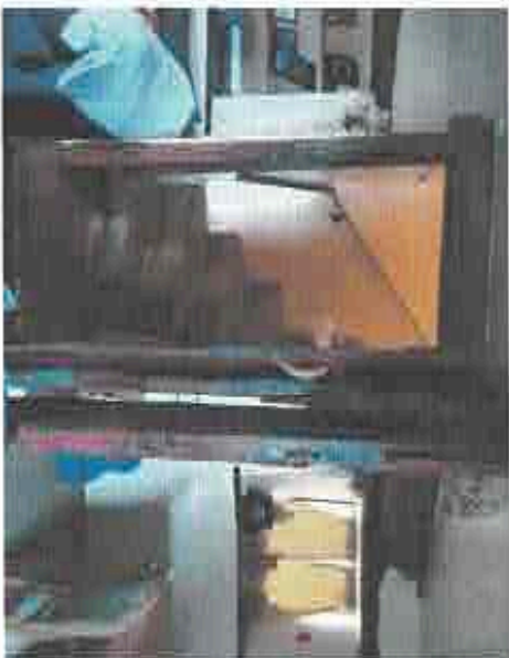
10. The main staircase