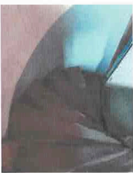
15. The attic staircase timber treads