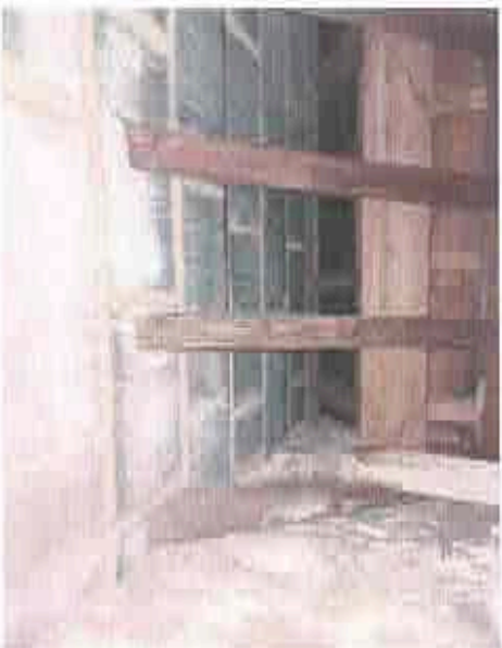
13. The attic space above north room showing brick walls and G20 roof structure