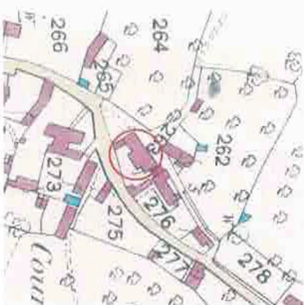
Fig.2: Extract from the 1886 1st edition OS map