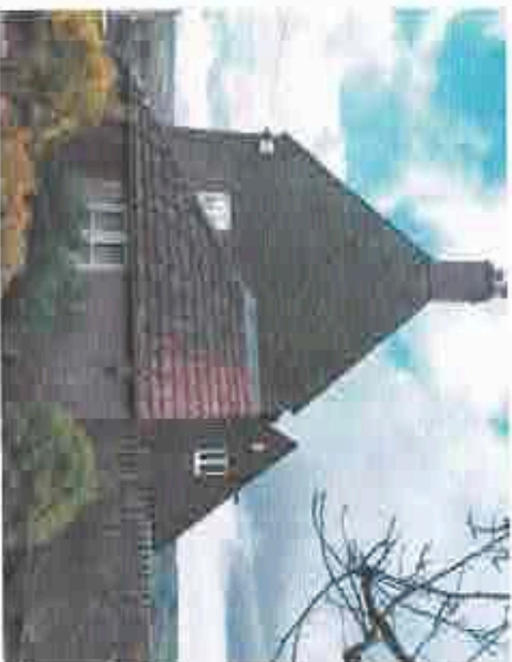
7. The southern gable end with rear extension