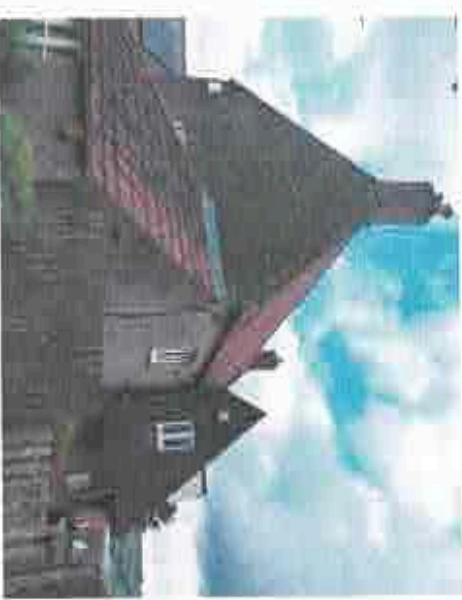
9. Walnut Tree House from the garden