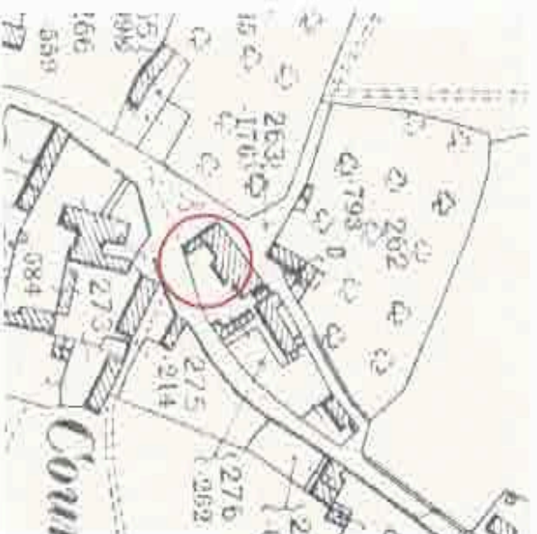
Fig.3: Extract from the 1903 2nd edition OS map