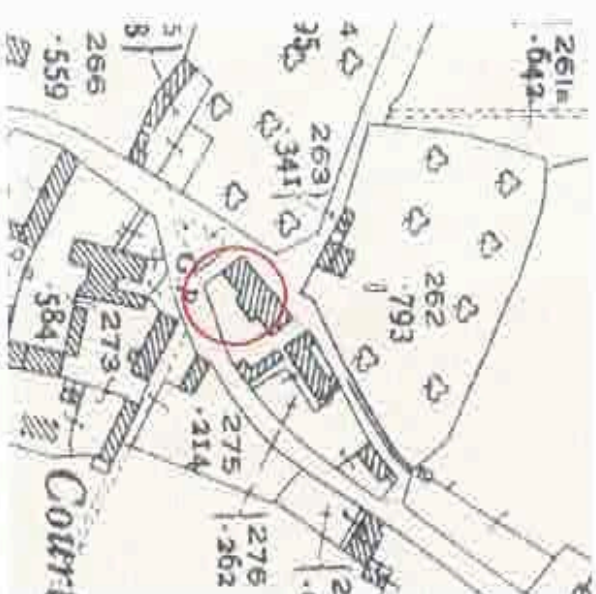
Fig.4: Extract from 1931 OS map