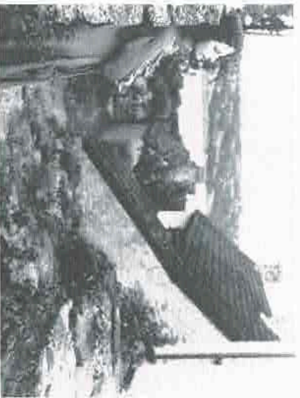
3. Lady Constance Malleson outside Wainui Tree House c.1930s