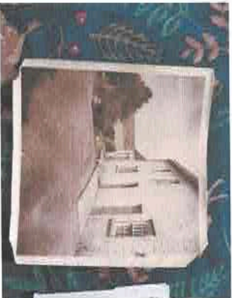
4. Walnut Tree House c.1920s with white-washed elevations