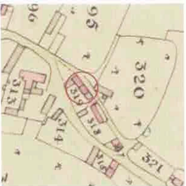
Fig.1: Extract from the 1840 Tithe map