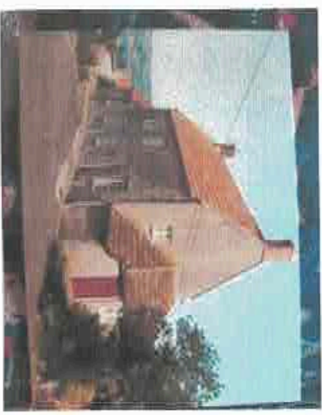
6. The cottage c.1970s, prior to the renovations