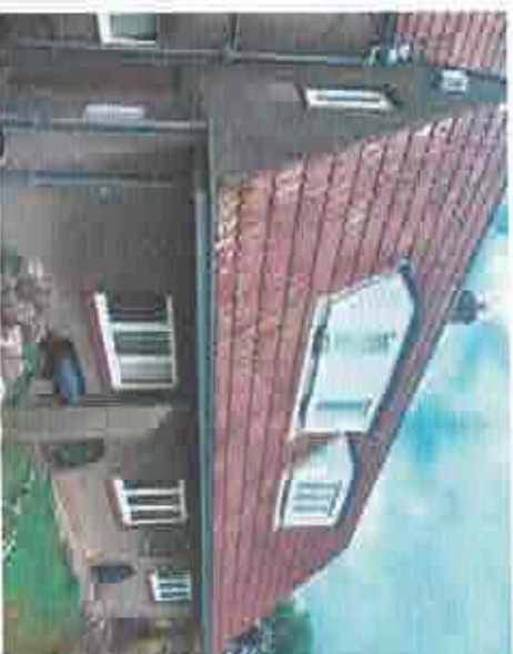
8. The rear extension