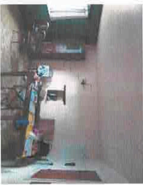
12. The northern room in which new stairs to attic will be created