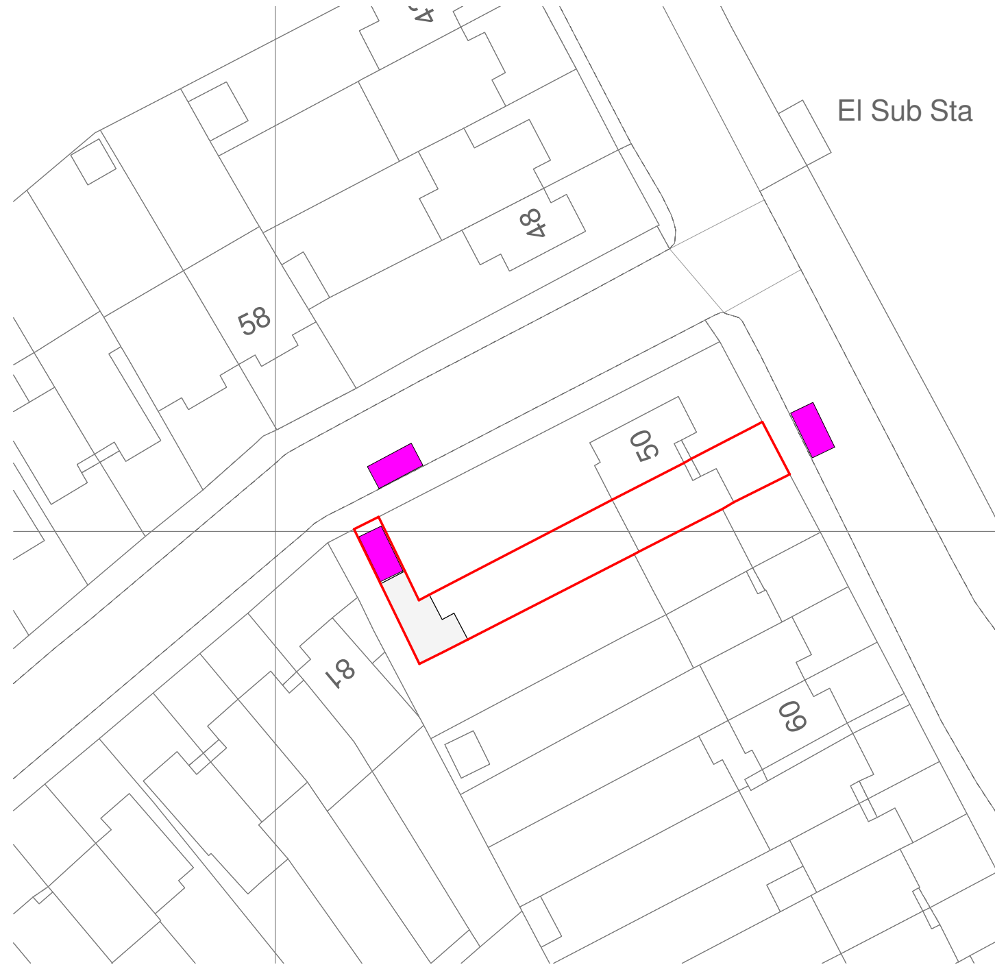
19/PPP - PARKING PROVISION 1:500