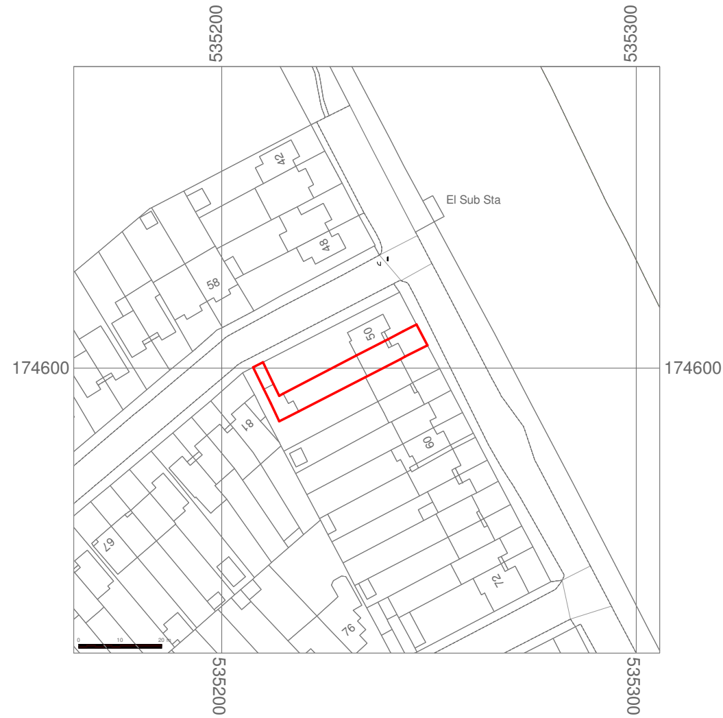
01/LP - LOCATION PLAN 1: 1250

OSGB Maps purchased from www.streetwise.net © Crown Copyright and database rights 2019 OS 100047474