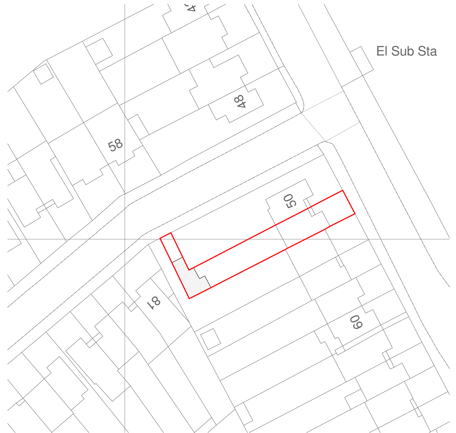
02/PBP - PROPOSED BLOCK PLAN 1: 500