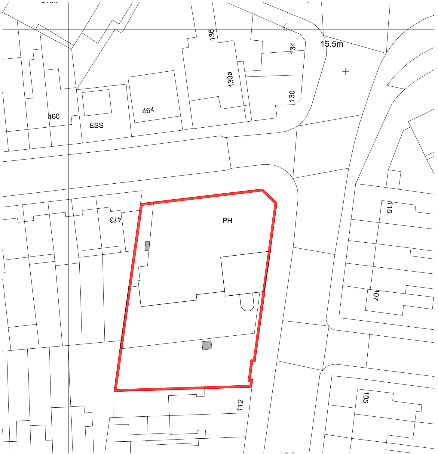
Block plan – scale 1:500