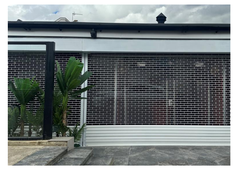
Canopy rear view