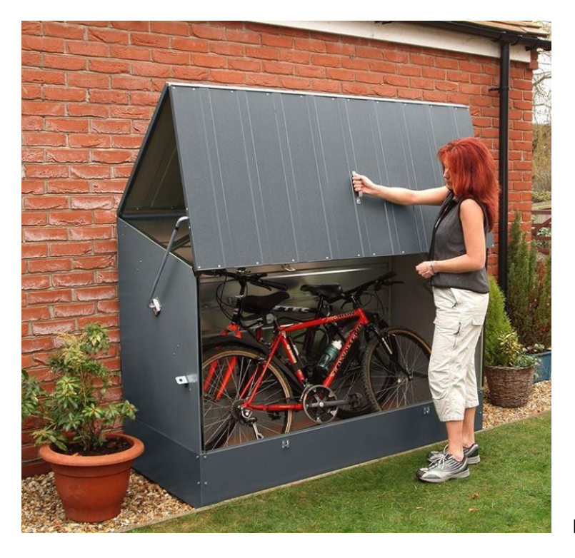
Ramped Metal Bike Shed – Opened