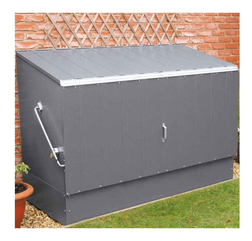
Ramped Metal Bike Shed - Closed