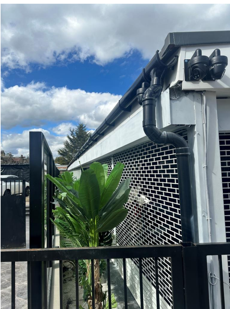
Canopy side view from High St