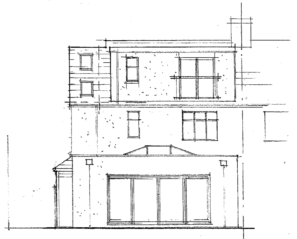
West elevation - rear

Materials Walls: Rendered to match existing Roof: Tiles to match existing Windows: Velux over new staircase