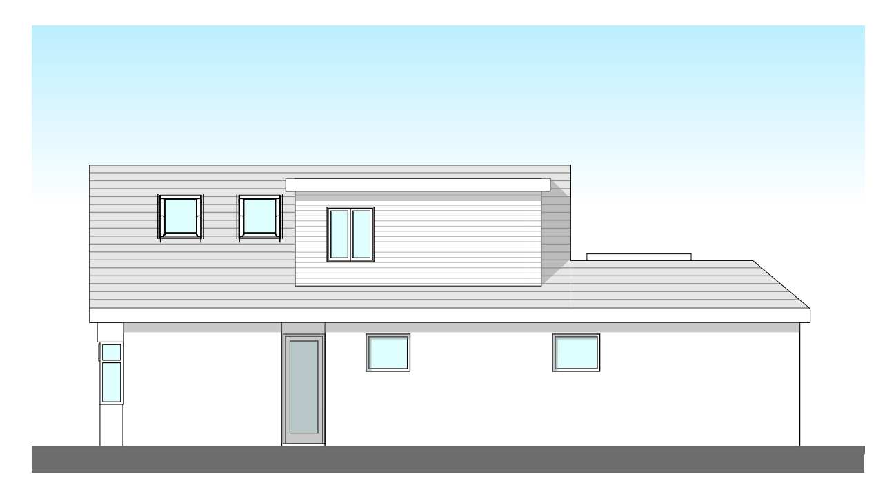
Proposed Side Elevation 1