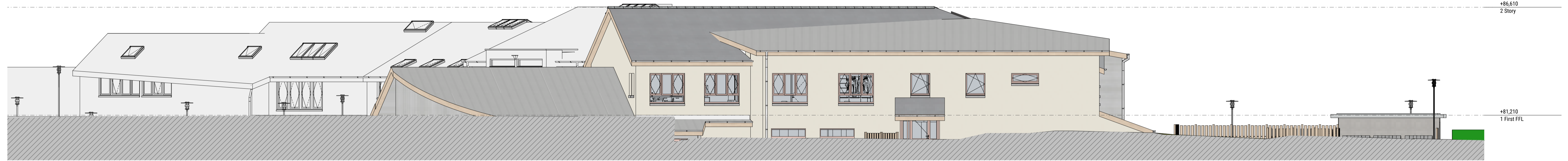
E-07 North West Elevation 0 5 10

NOTES 1. Do not scale off this drawing for construction purposes. 2. All dimensions are in millimetres unless otherwise stated. 3. This drawing to be read in conjunction with all relevant Taylor Architectures, civil/structural, and services engineer's drawings and specifications.