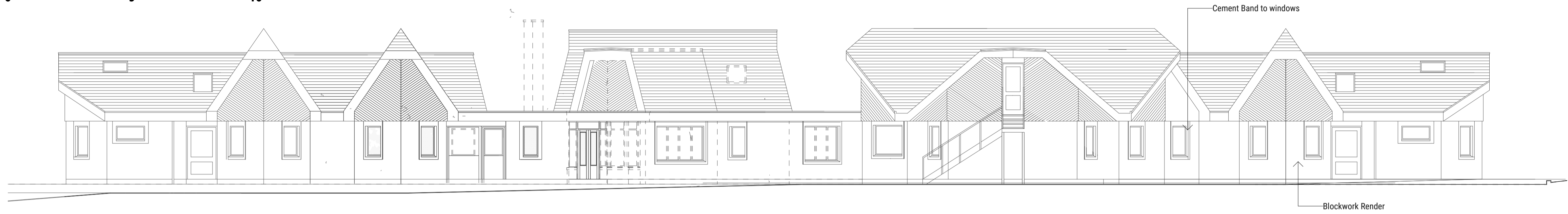
06 Whithorn Carnoc Demolition Elevations East