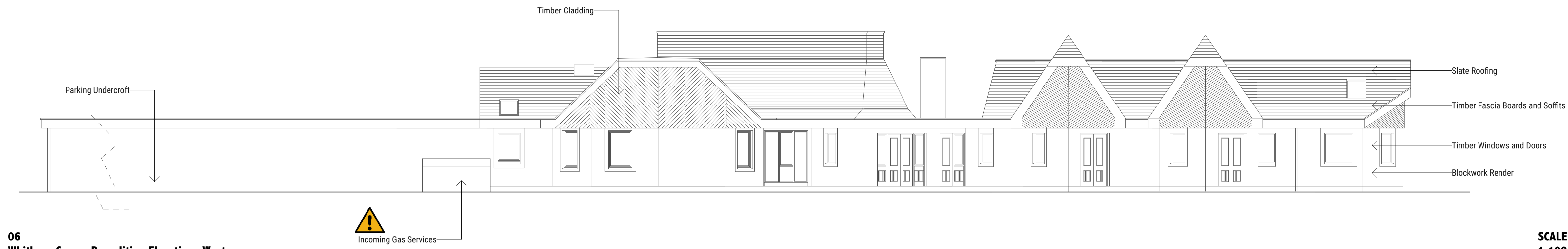
06 Whithorn Carnoc Demolition Elevations West

NOTES 1. Do not scale off this drawing for construction purposes. 2. All dimensions are in millimetres unless otherwise stated. 3. The drawings to be read in conjunction with all relevant Taylor Architectures, civil/structural, and services engineer's drawings and specifications.