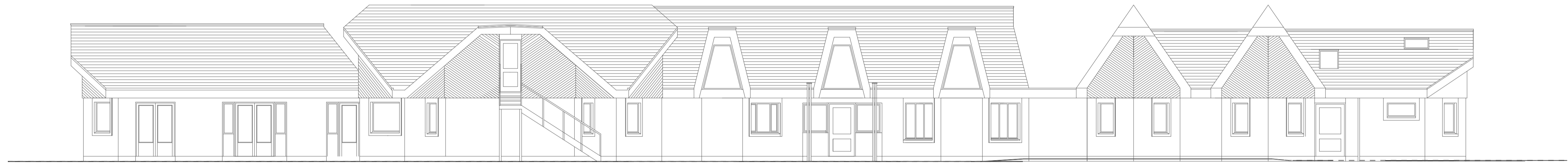
06 Whithorn Carnoc Demolition Elevations South