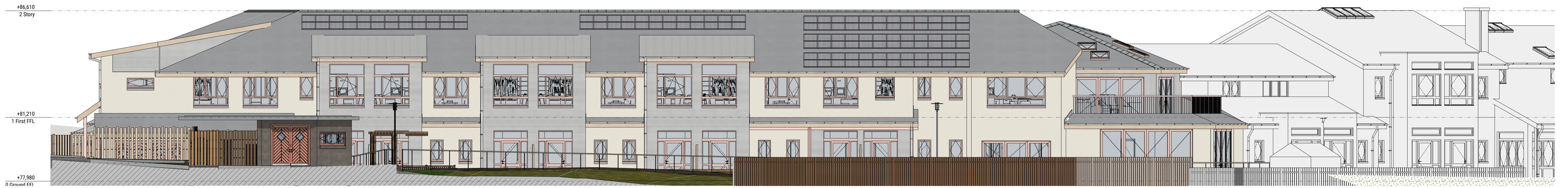
E-05 South West Elevation

NOTES 1. Do not scale off this drawing for construction purposes. 2. All dimensions are in millimetres unless otherwise stated. 3. The drawings to be read in conjunction with all relevant Taylor Architectures, civil/structural, and services engineer's drawings and specifications.