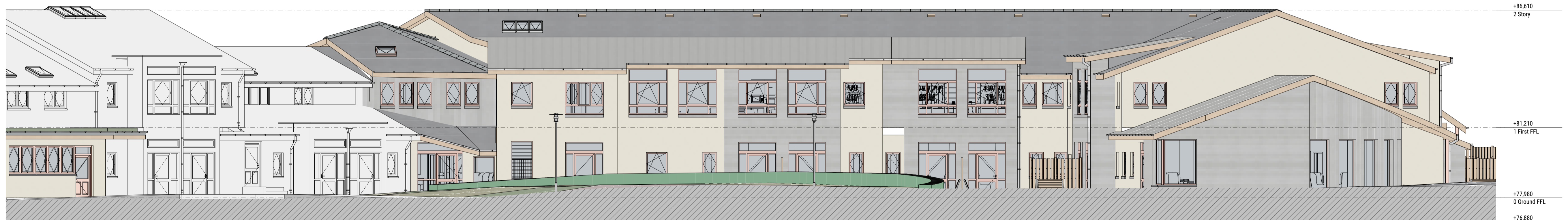
E-06 NE Elevation