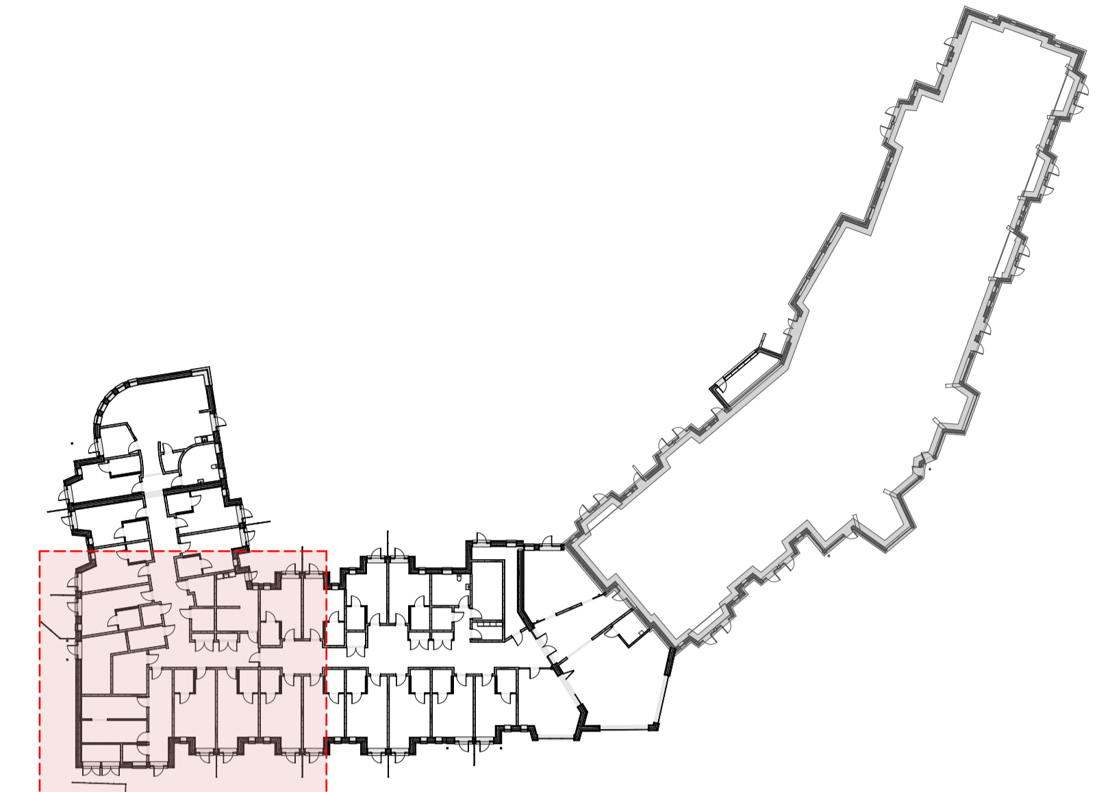
0. Key Plan GF 0 5 10 15 20 25 30 35 40 45 50