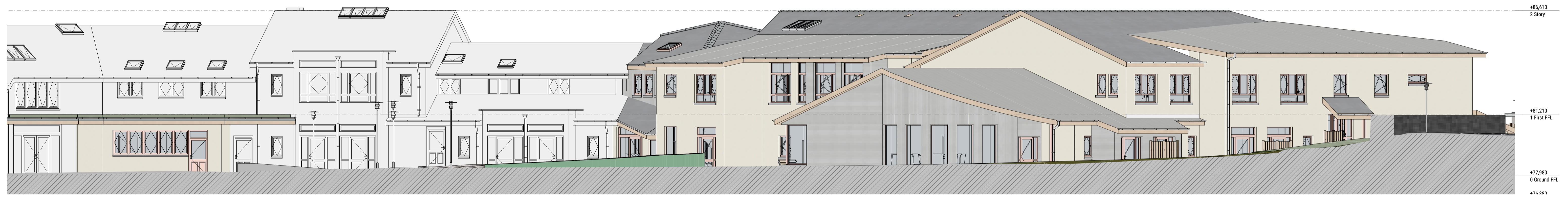
E-02 North Elevation