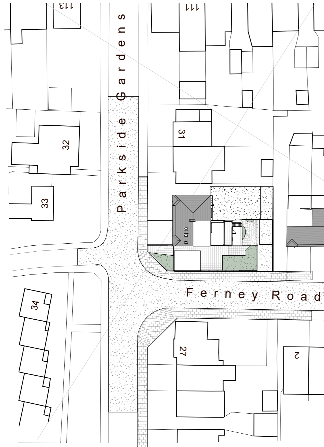
1 Existing Block Plan