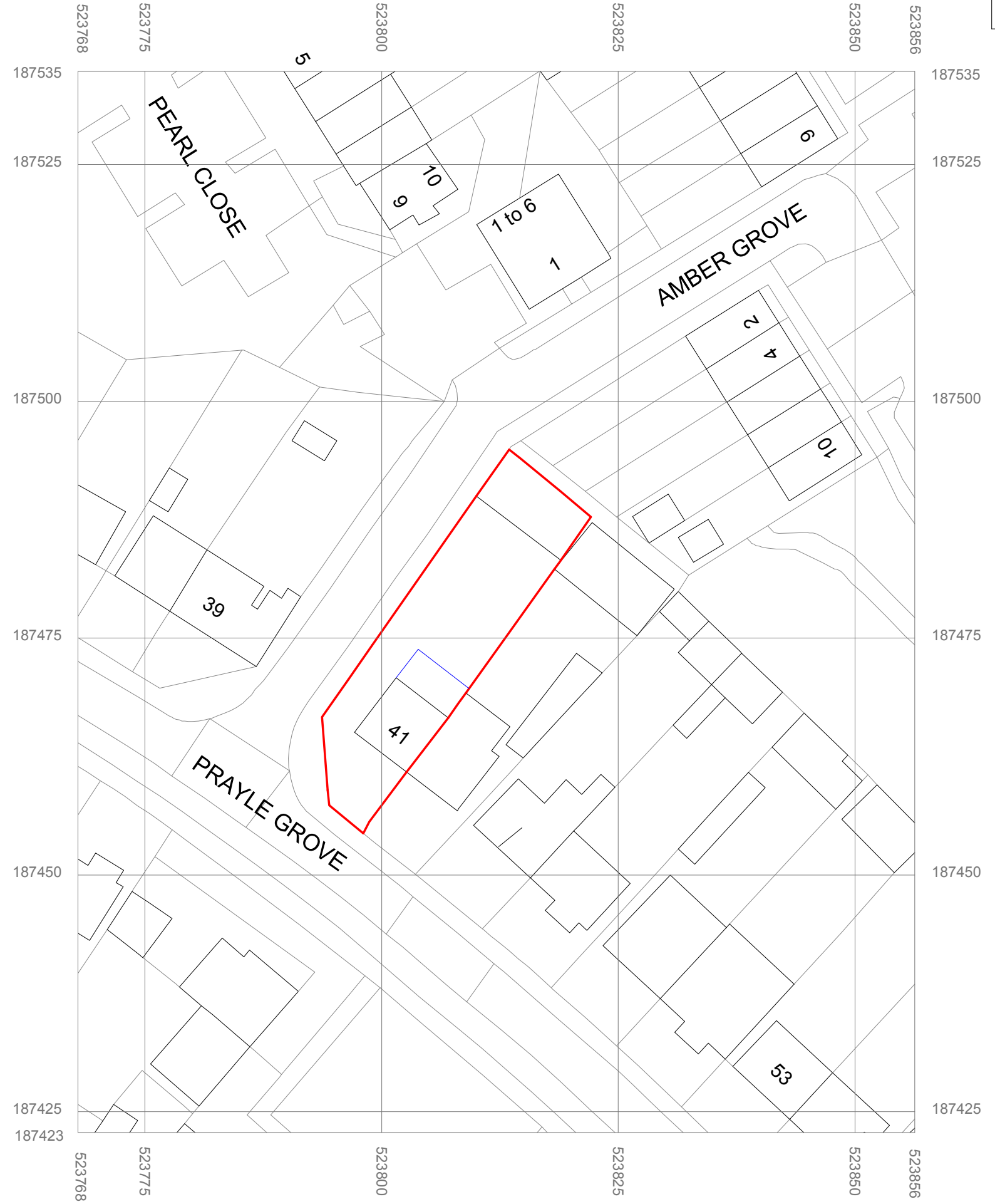
Proposed Site Block Plan 1:500@A3