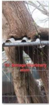
T4 - Primary Stem Damage