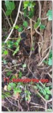
T1 - Ganoderma spp.