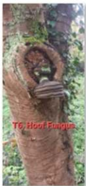
T6 - Hoof Fungus