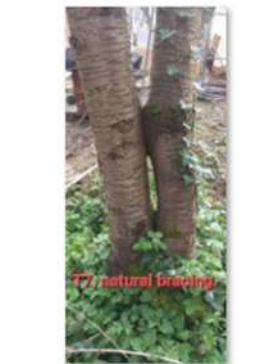
T7 - Natural Bracing