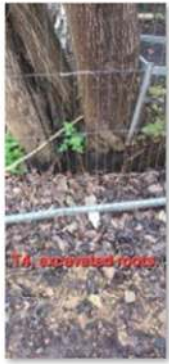
T4 - Excavated Roots