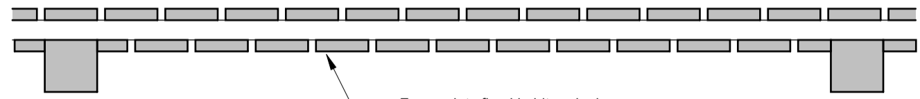
Plan of Fence