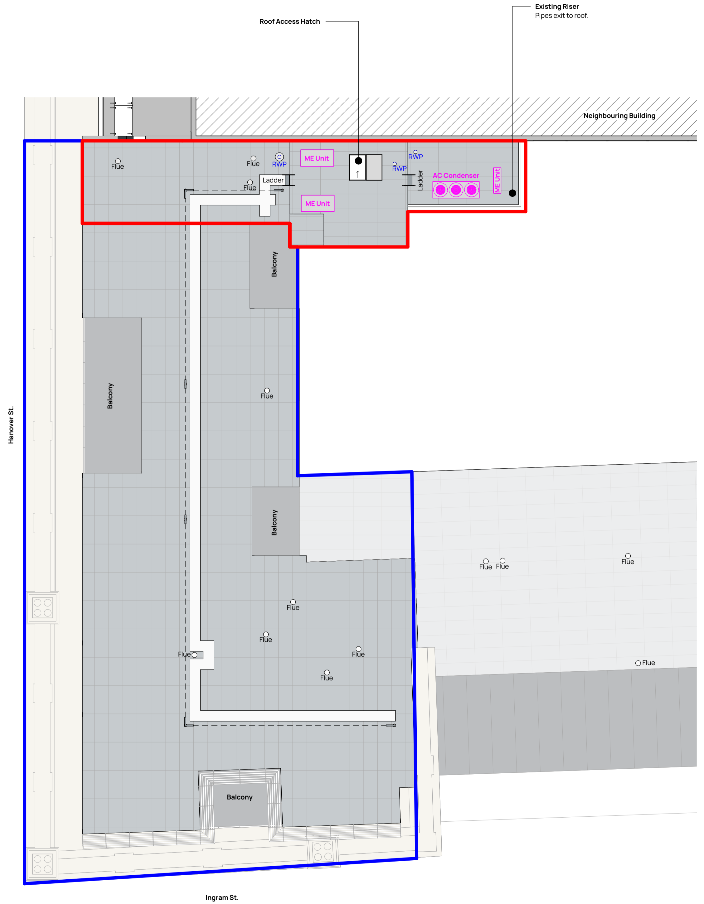
Existing Plan 1:100