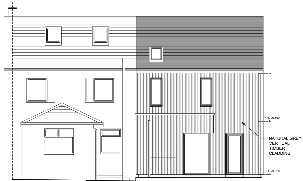
PROPOSED NORTH ELEVATION 1:100