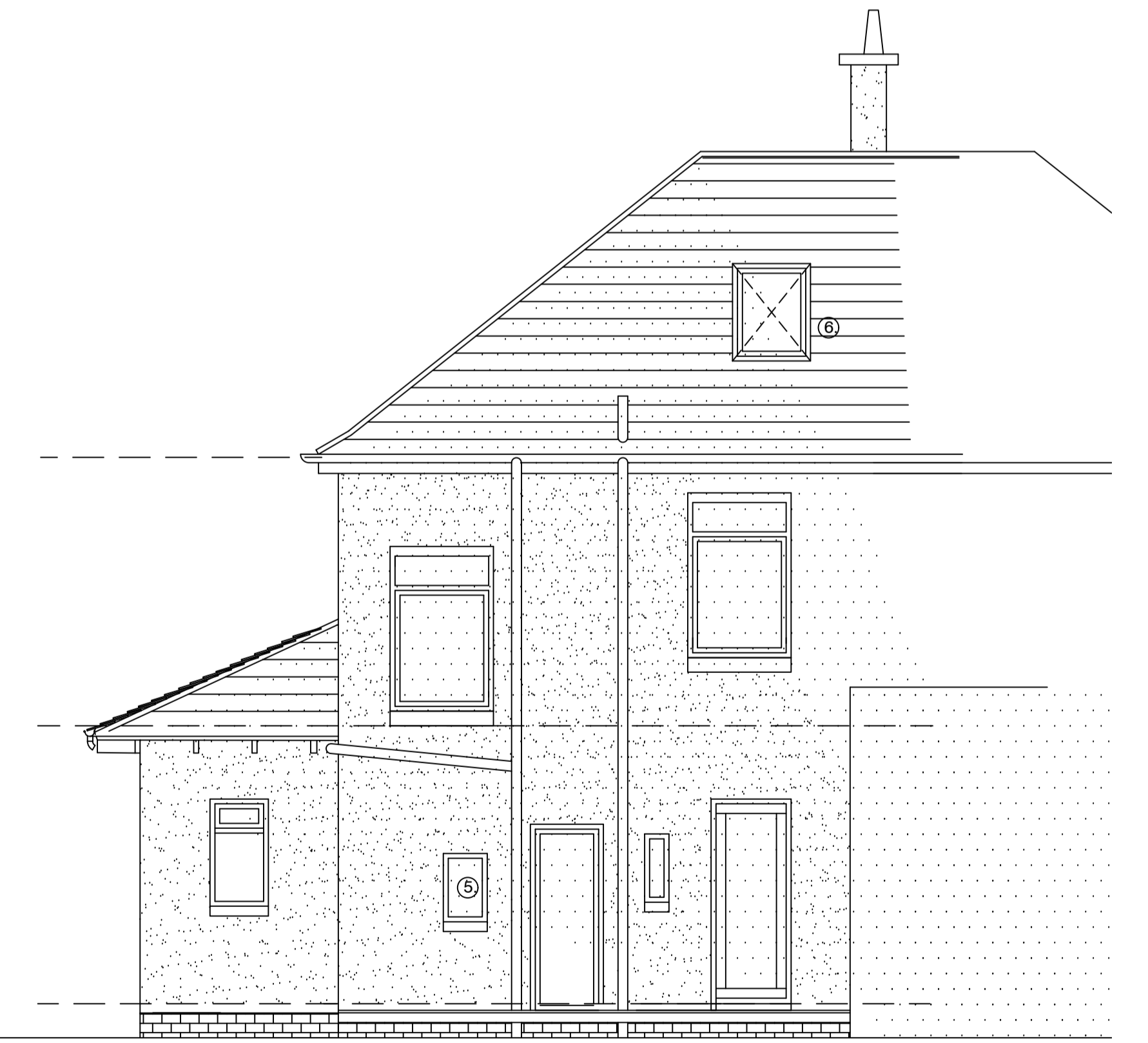
existing elevation south east