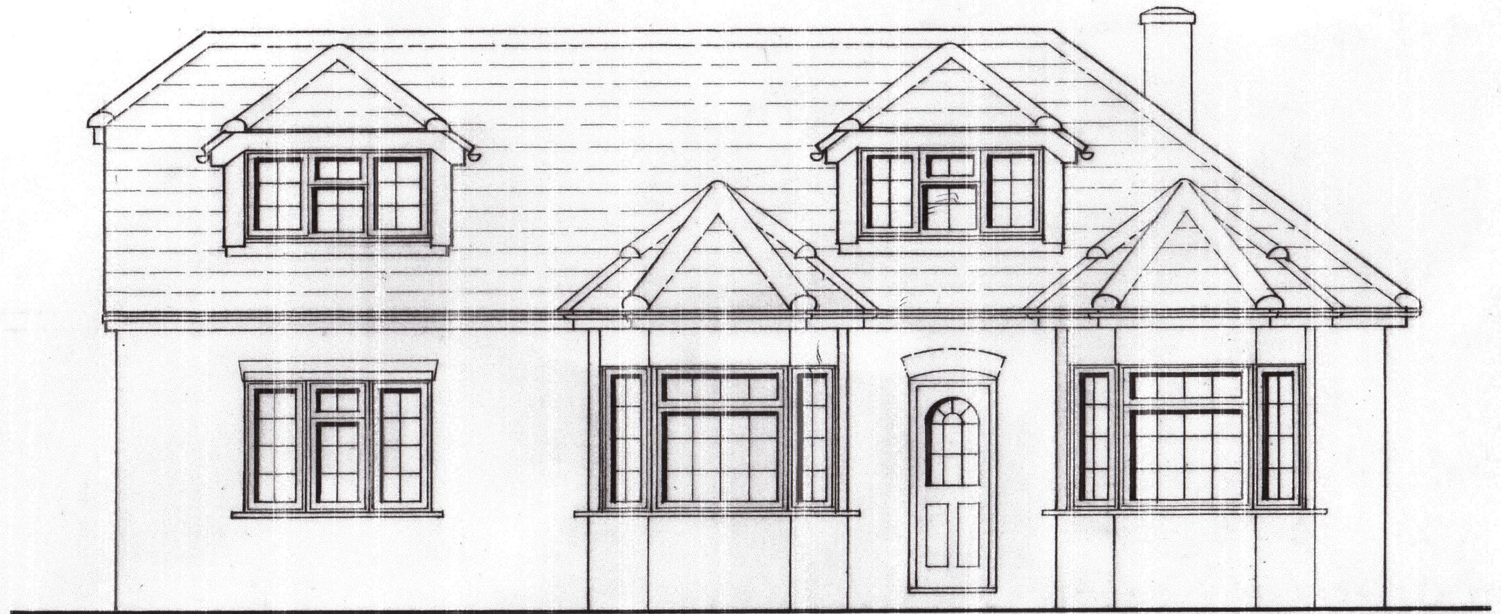
EAST (FRONT) ELEVATION ~ RETAINED UNALTERED.