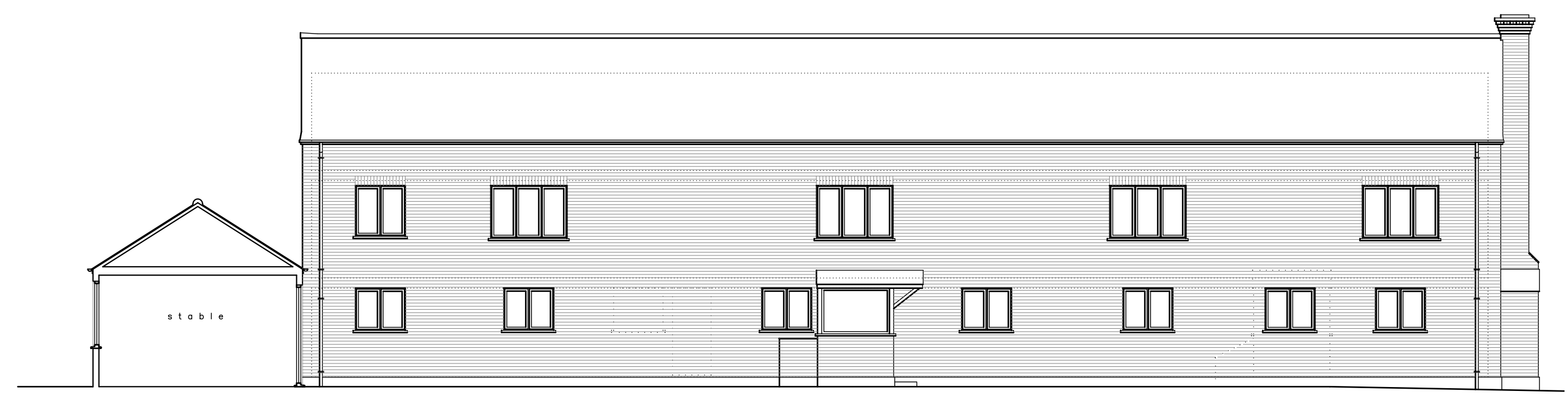
front elevation scale 1:100