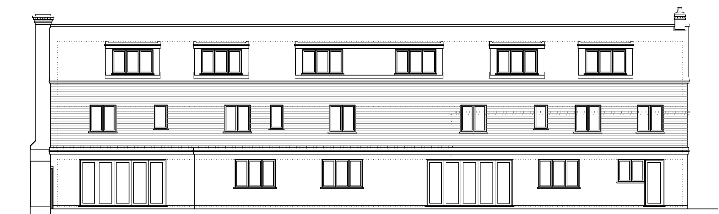
rear elevation scale 1:100