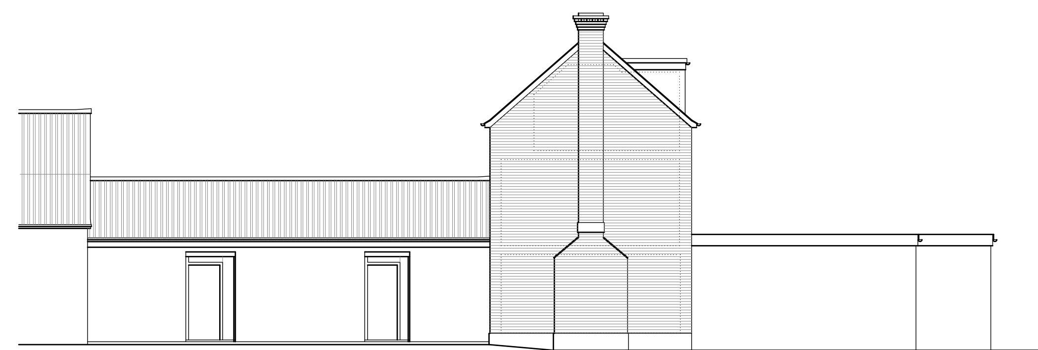
side elevation scale 1:100