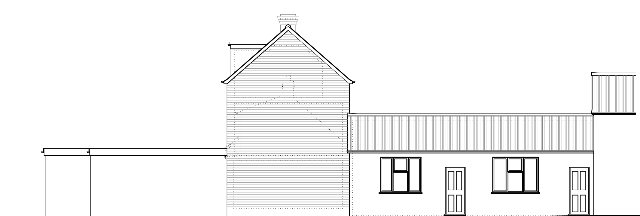
side elevation scale 1:100