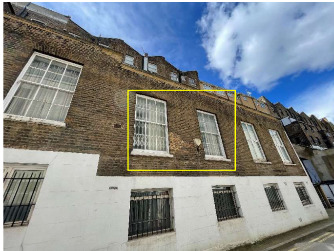
REAR VIEW OF THE PROPERTY