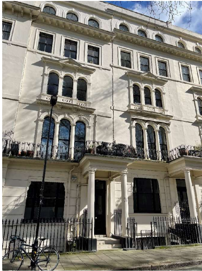
FRONT VIEW OF THE PROPERTY