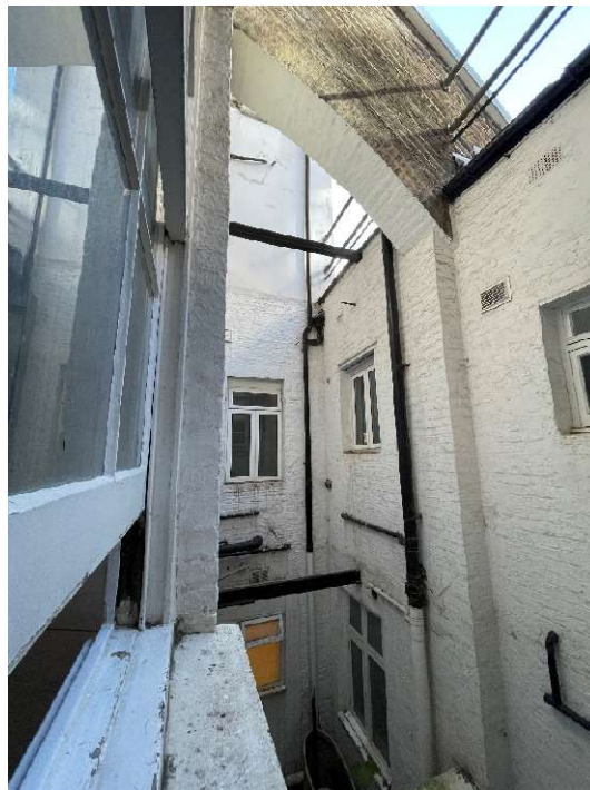
VIEW OF THE LIGHTWELL FROM THE KITCHEN WINDOW TOWARD OTHER FLATS