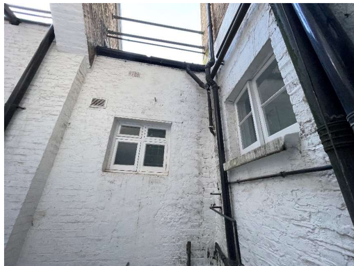
VIEWS OF LIGHTWELL FROM THE KITCHEN WINDOW TOP: CENTRE WINDOW SERVES THE WC BOTTON: LEFT WINDOW ID THE BATHROOM, RIGHT WINDOW IS THE WC.