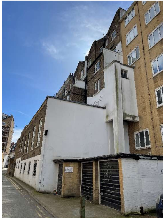
REAR VIEW OF THE PROPERTY