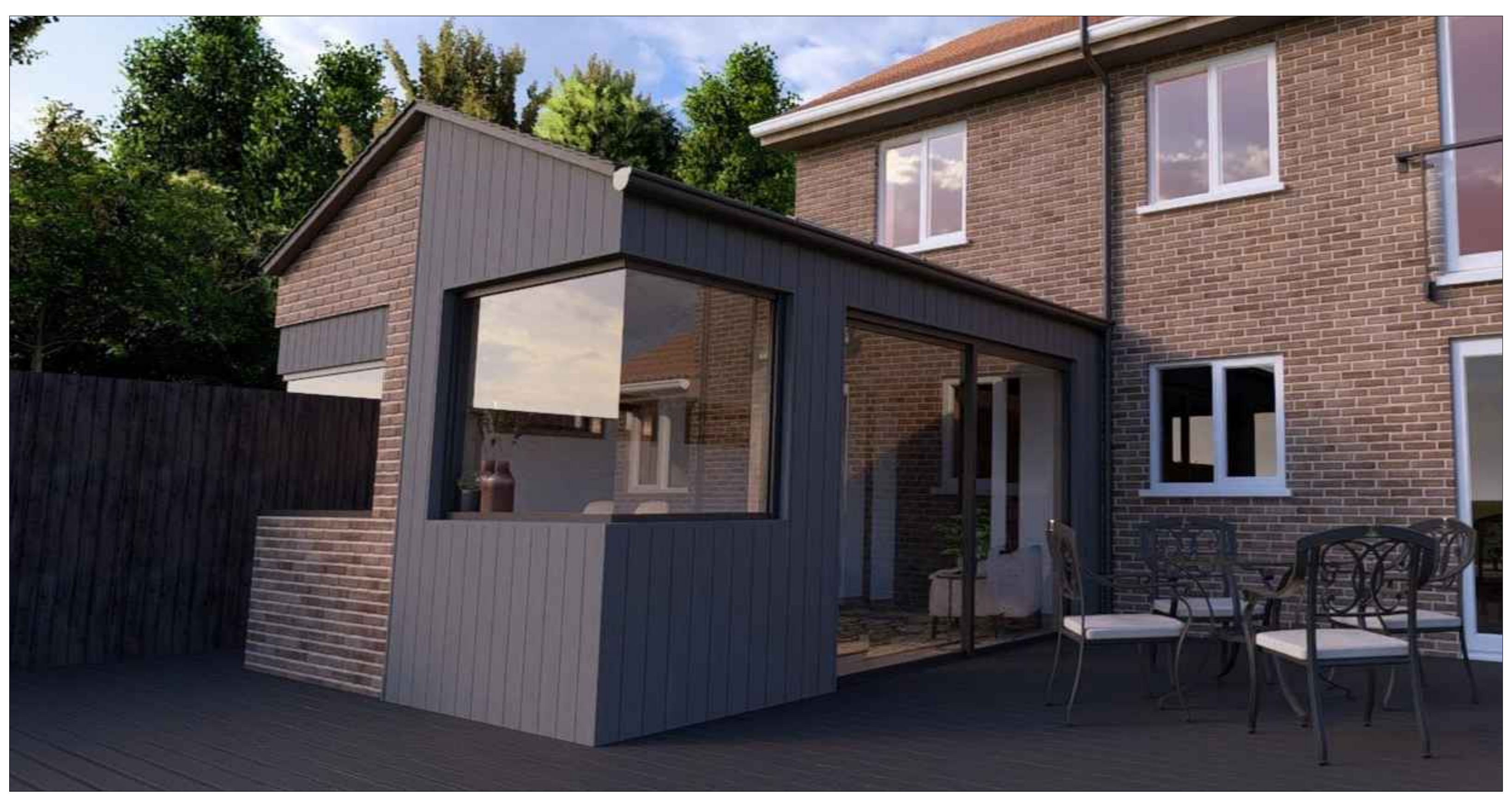
Proposed External Snapshot Not To Scale