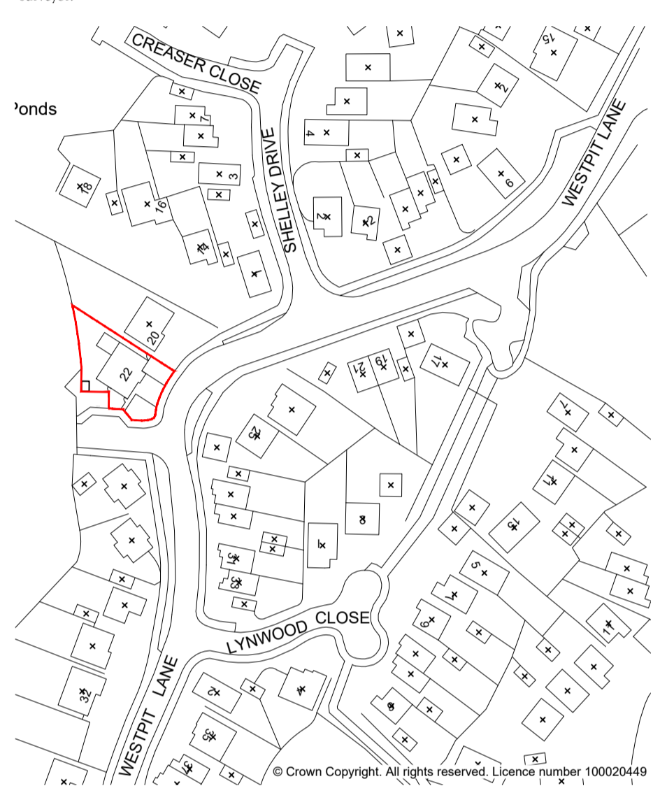
Proposed Location Plan 1:1250

As with all work affecting neighbours, it is always better to reach a friendly agreement rather than resort to any law. Even where the work requires a notice to be served, it is better to informally discuss the intended work, consider the neighbours comments, and amend your plans (if appropriate) before serving the notice. If there is any doubt please consult The Planning & Design Associates or a party wall surveyor.