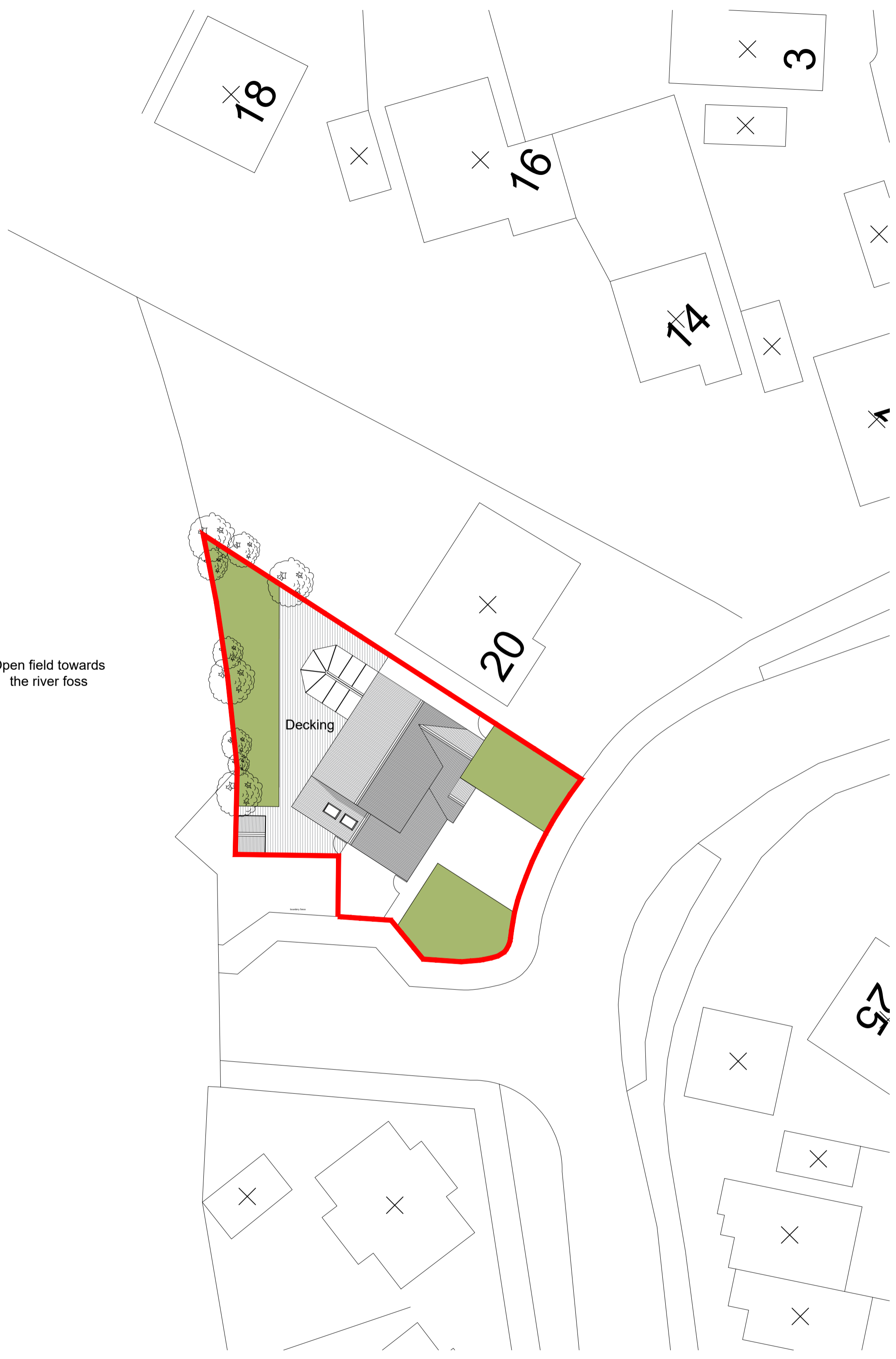
Existing Site Plan 1:200