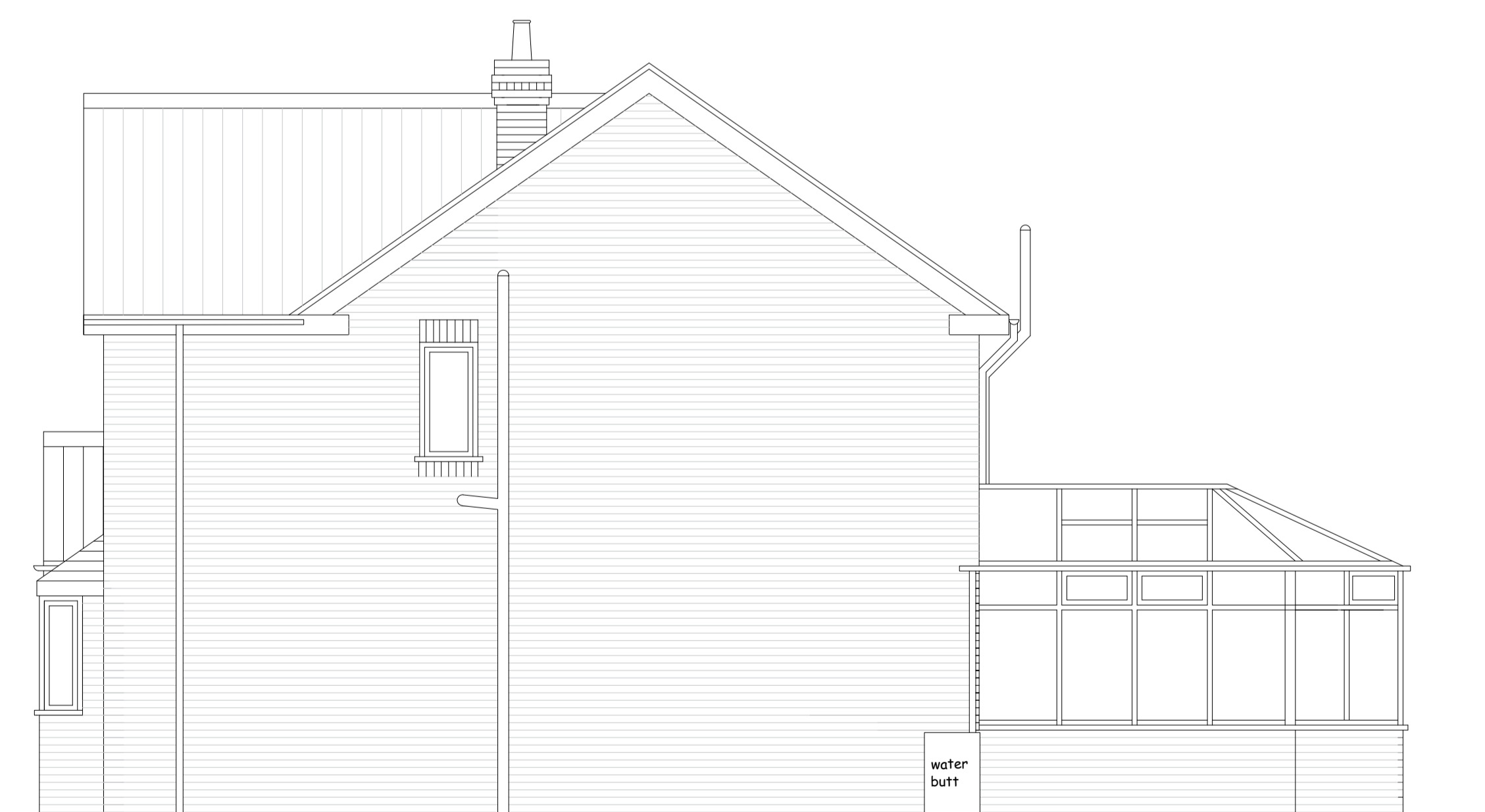
Side North East Elevation 1:50

The West Pit Lane Development EXISTING ELEVATIONS