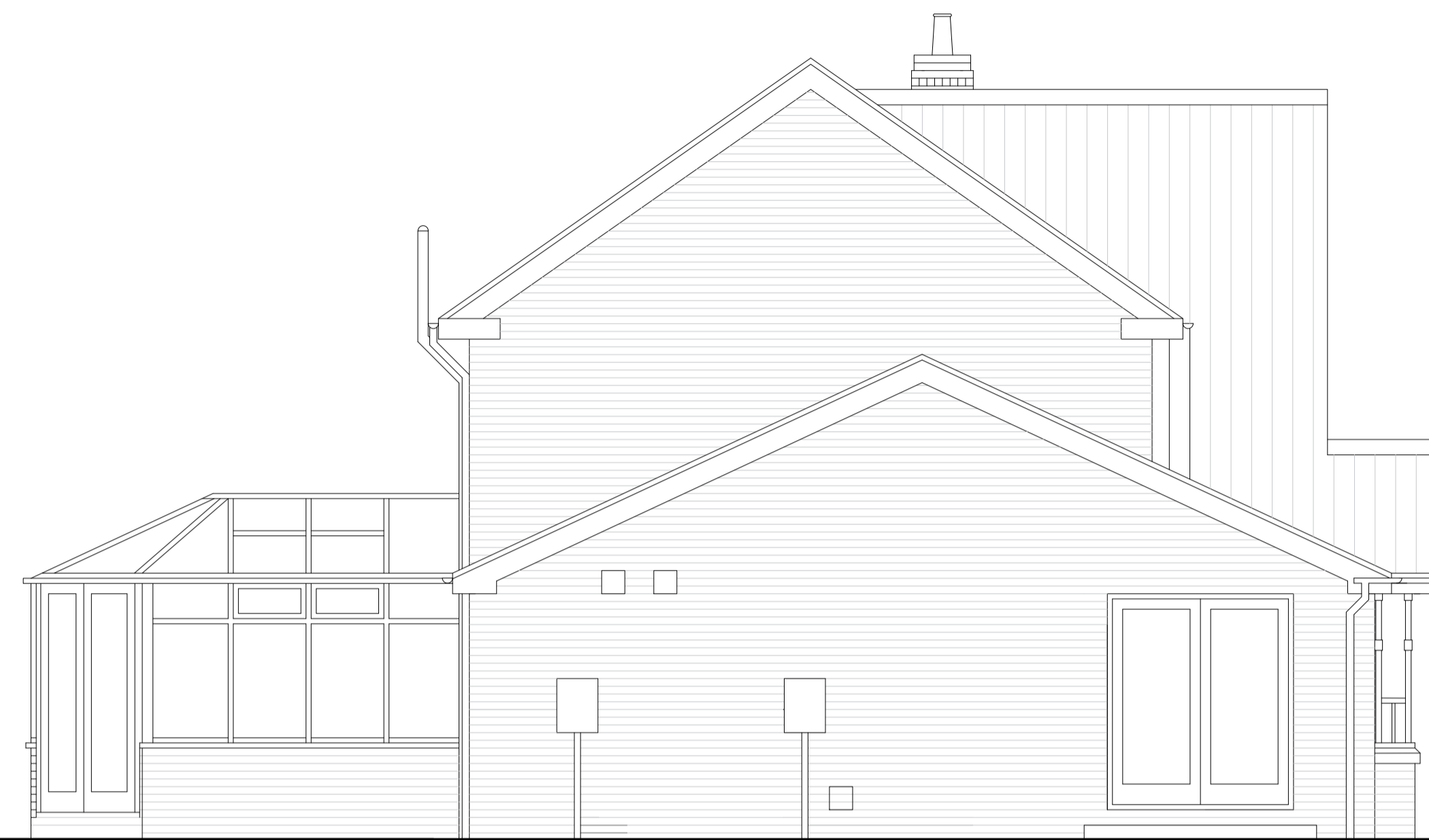
Side South West Elevation 1:50