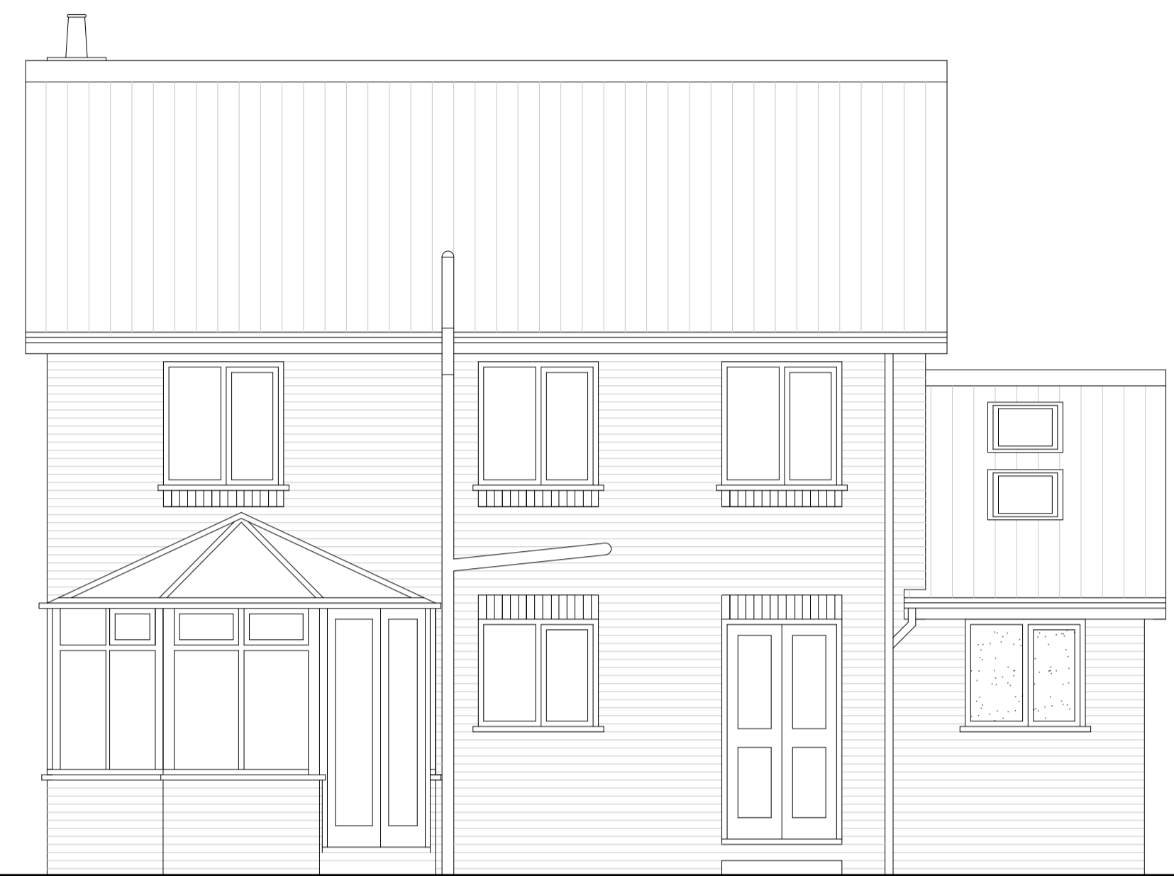
Rear North West Elevation 1:50