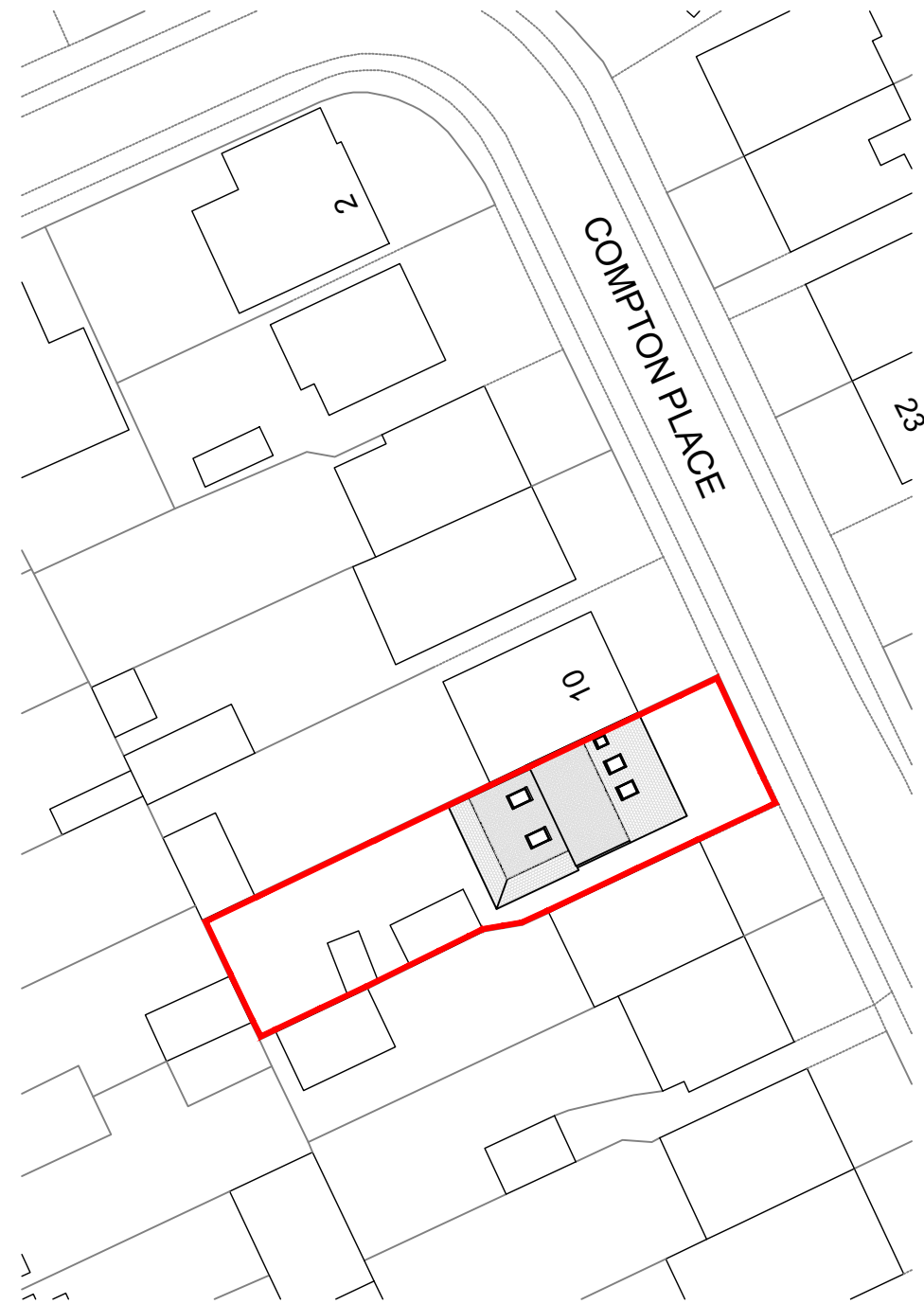
Proposed Block Plan 1:500