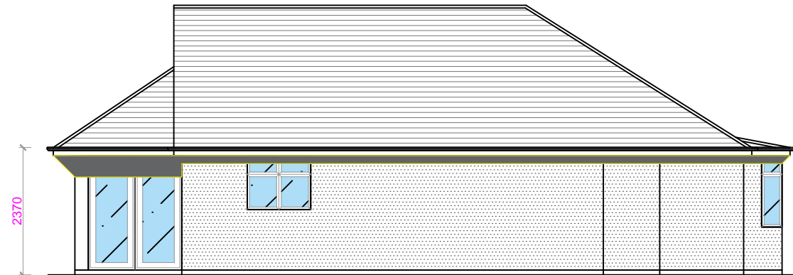
Existing LHS Elevation