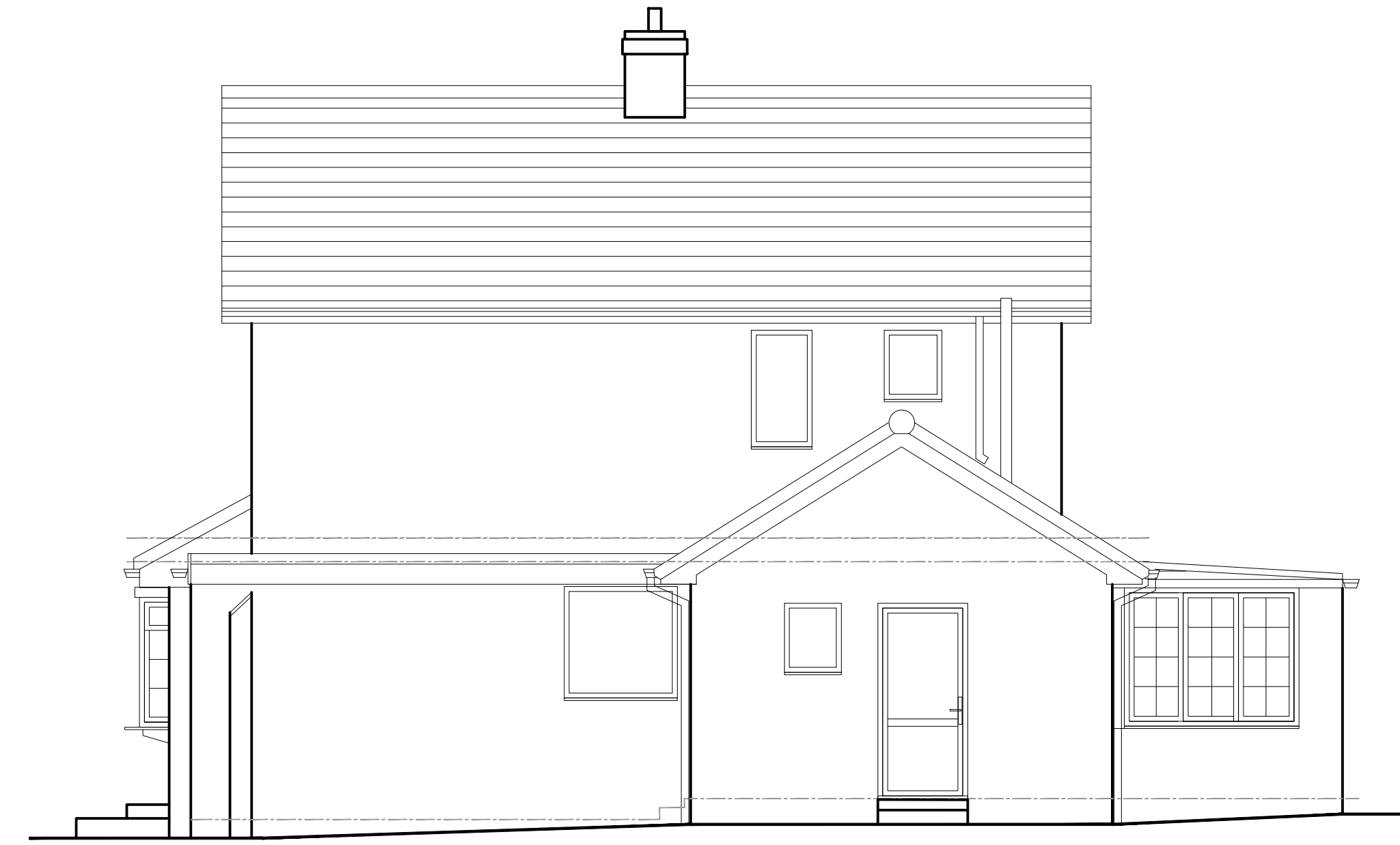
ELEVATION - EAST FACING