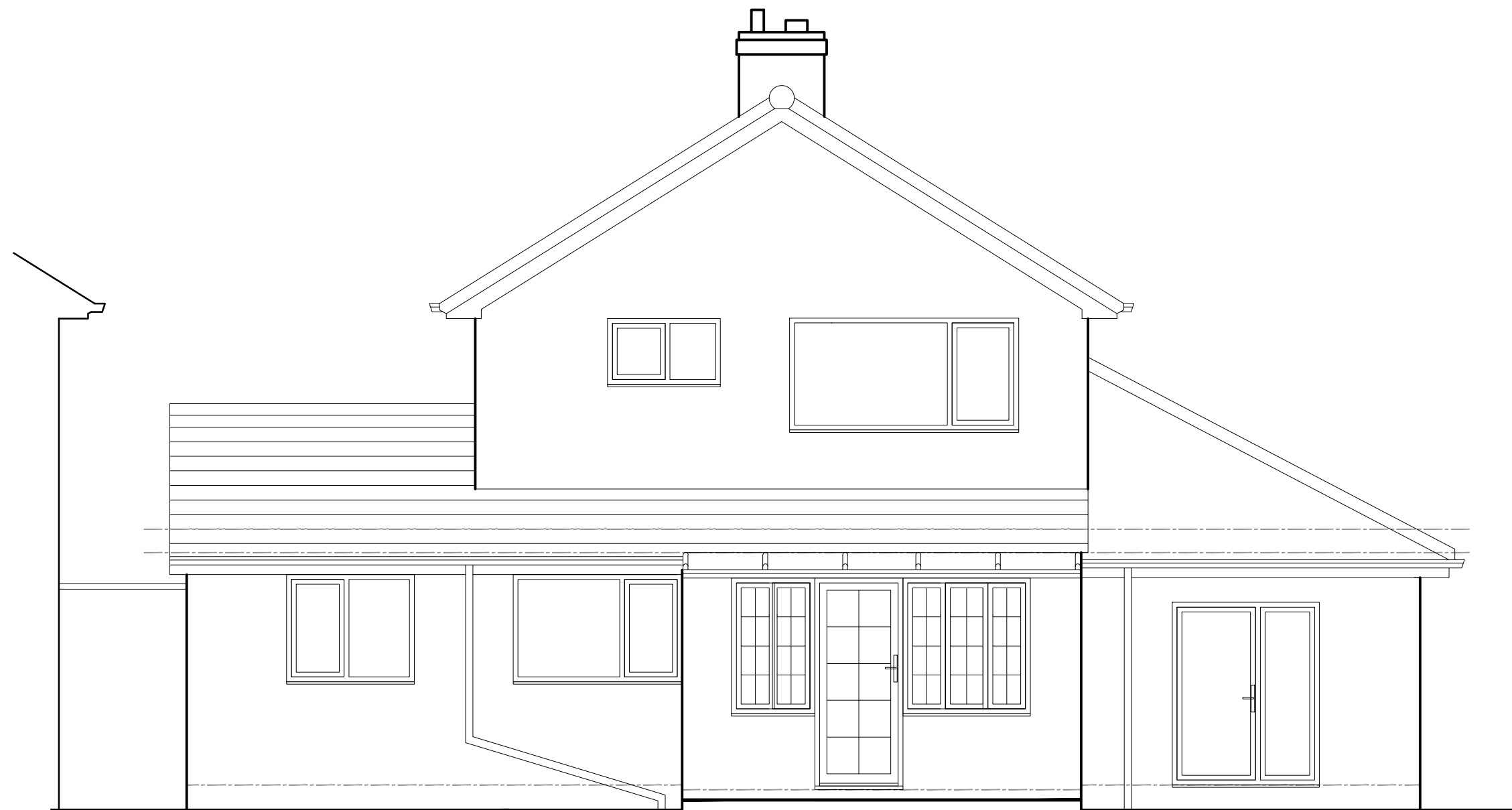
ELEVATION - SOUTH FACING