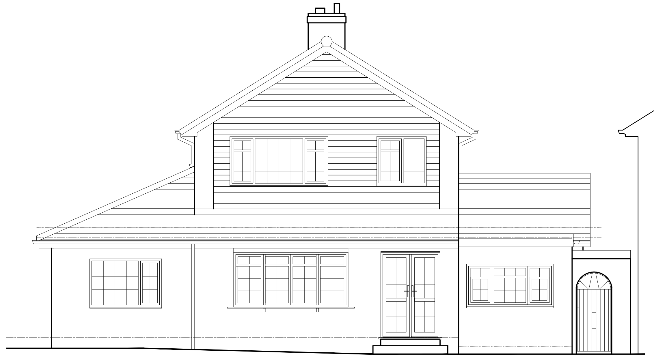
ELEVATION - NORTH FACING