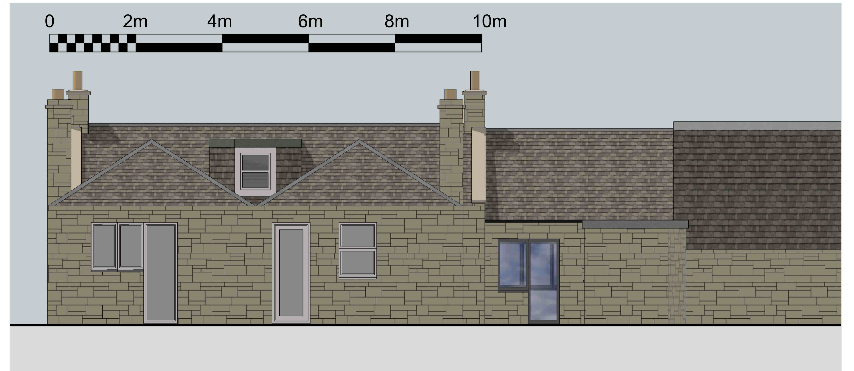
proposed rear/NE elevation 1:50 @ A1