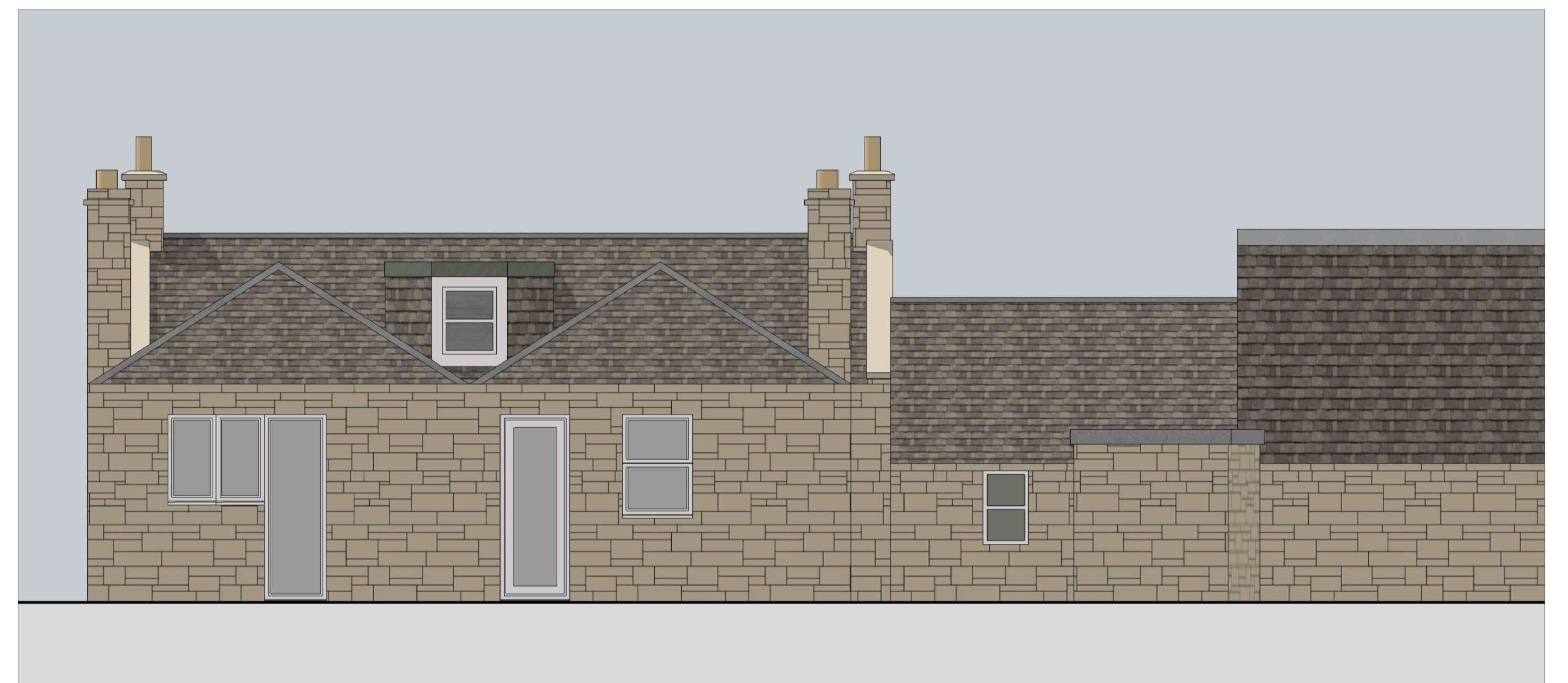
existing rear/NE elevation 1:50 @ A1