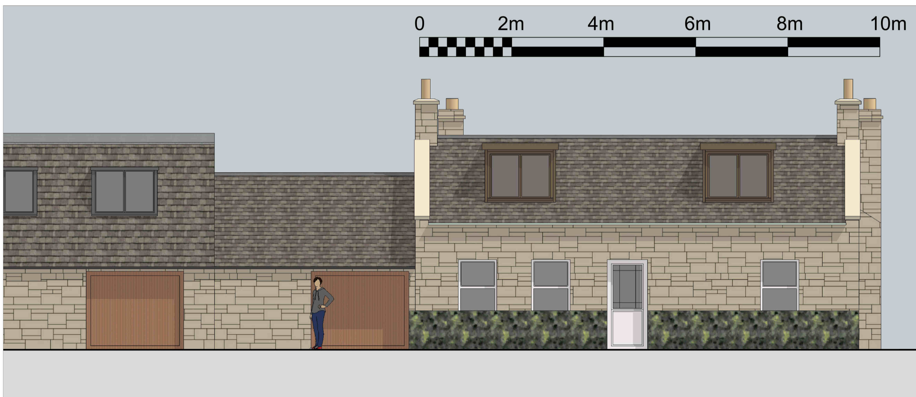
existing front/SW elevation 1:50 @ A1