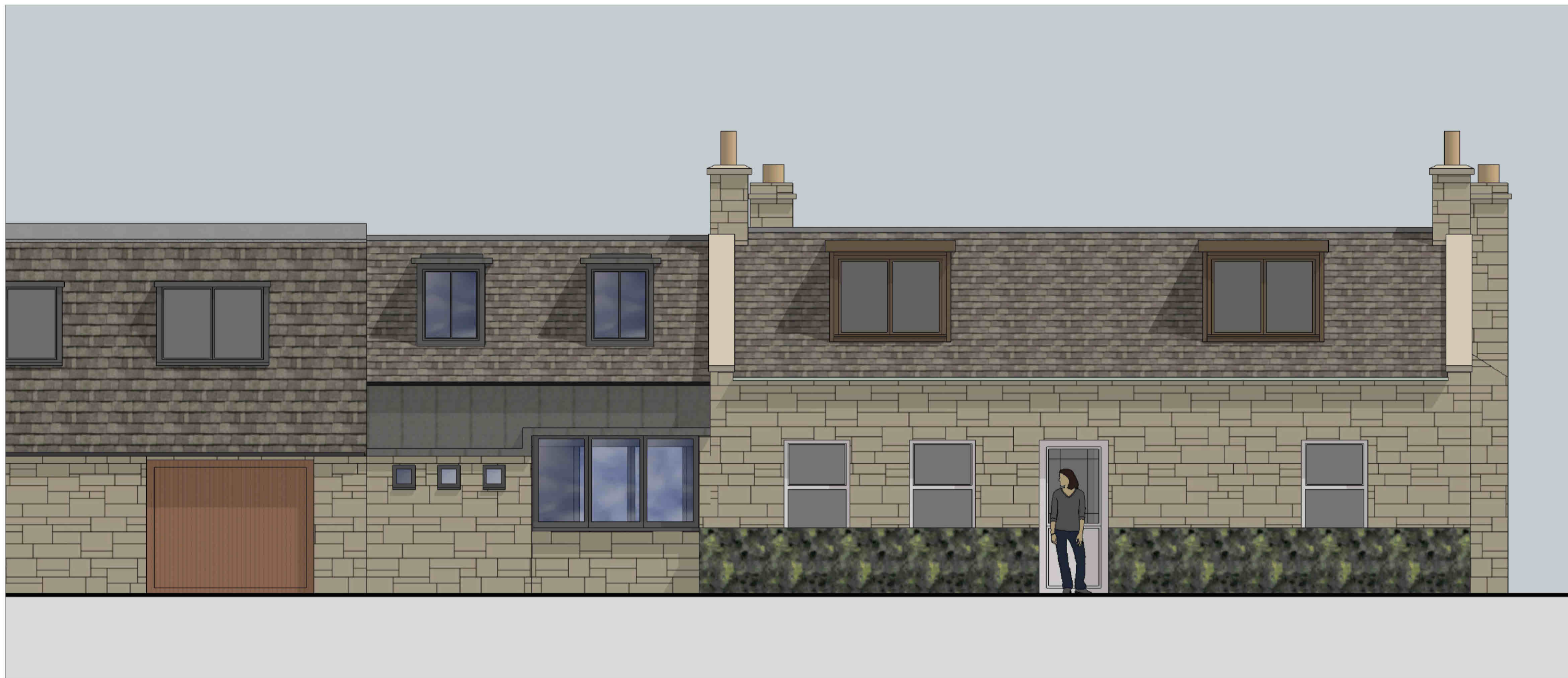
proposed front/SW elevation 1:50 @ A1