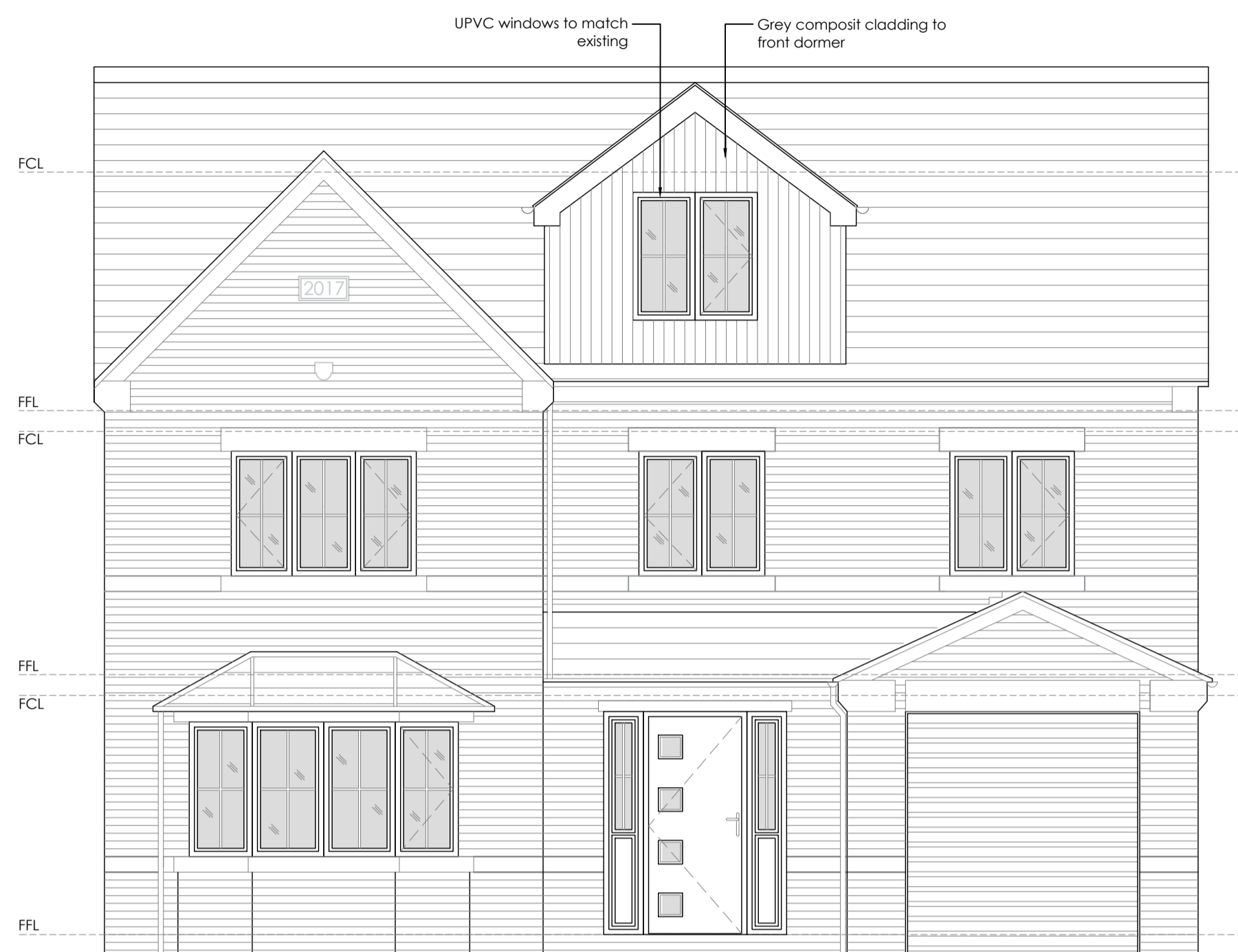
Front Elevation 01 as PROPOSED 1:50@A1 / 1:100@A3

DO NOT SCALE - Use only written dimensions. All dimension must be verified prior to the works being put into hand and any discrepancies reported to the originator. This drawing is copyright and shall not be reproduced or used for any other purpose without the written permission of Parker Liddle Architecture. This drawing must be read in conjunction with all other related drawings and it is the contractor's responsibility to ensure full compliance with the Building Regulations. Drawing to be used only as described in the drawing notes below.