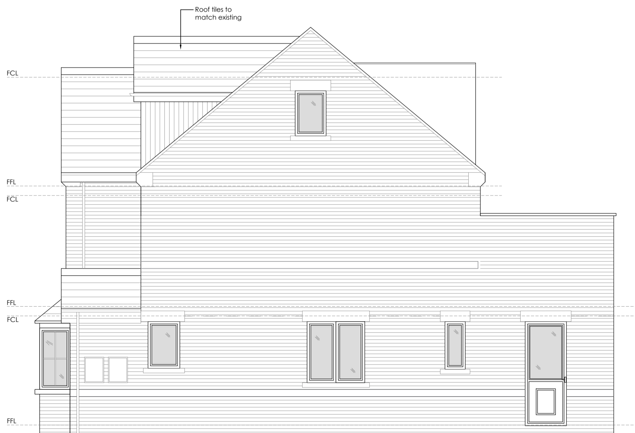
Side Elevation 02 as PROPOSED 1:50@A1 / 1:100@A3