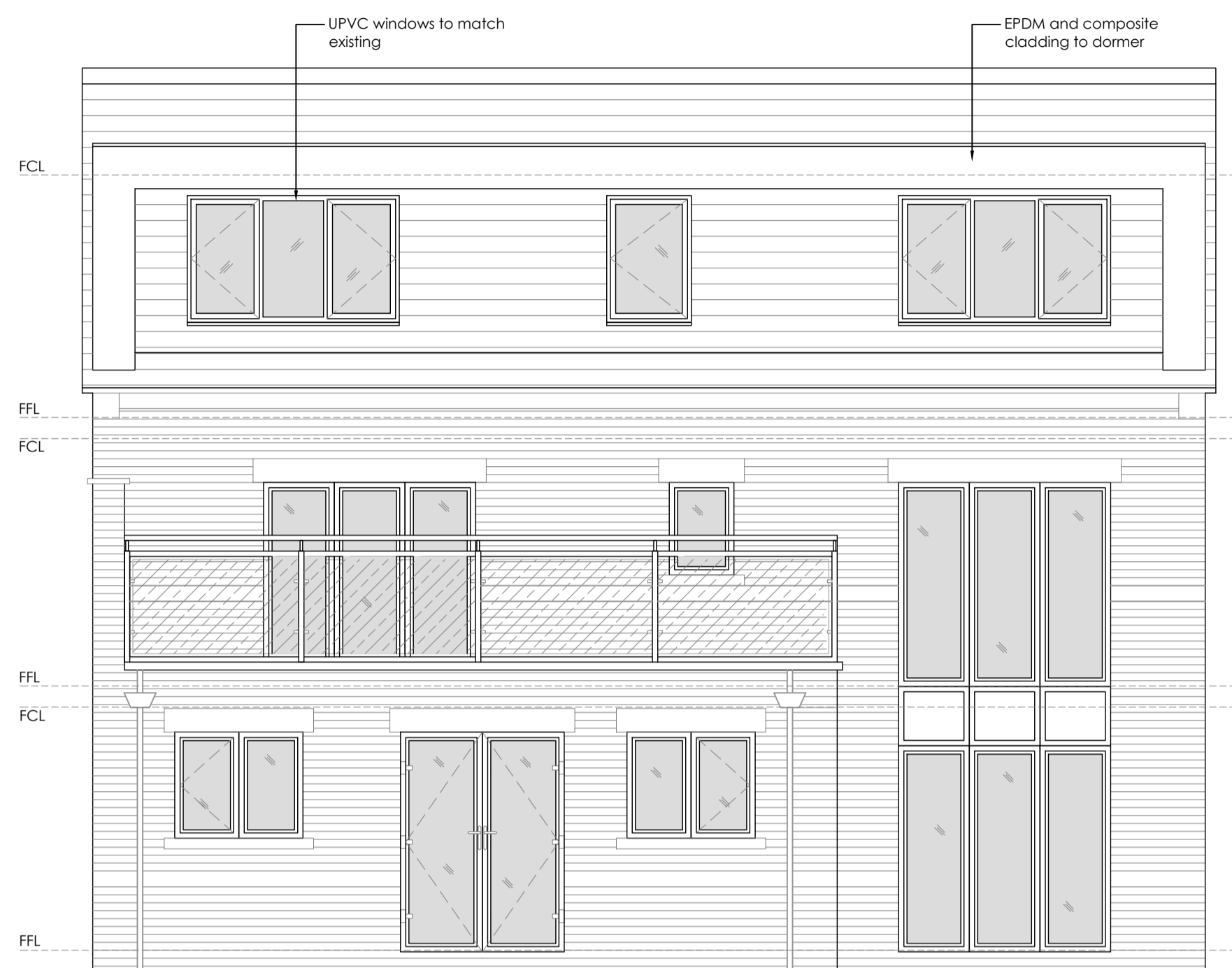
Rear Elevation 03 as PROPOSED 1:50@A1 / 1:100@A3