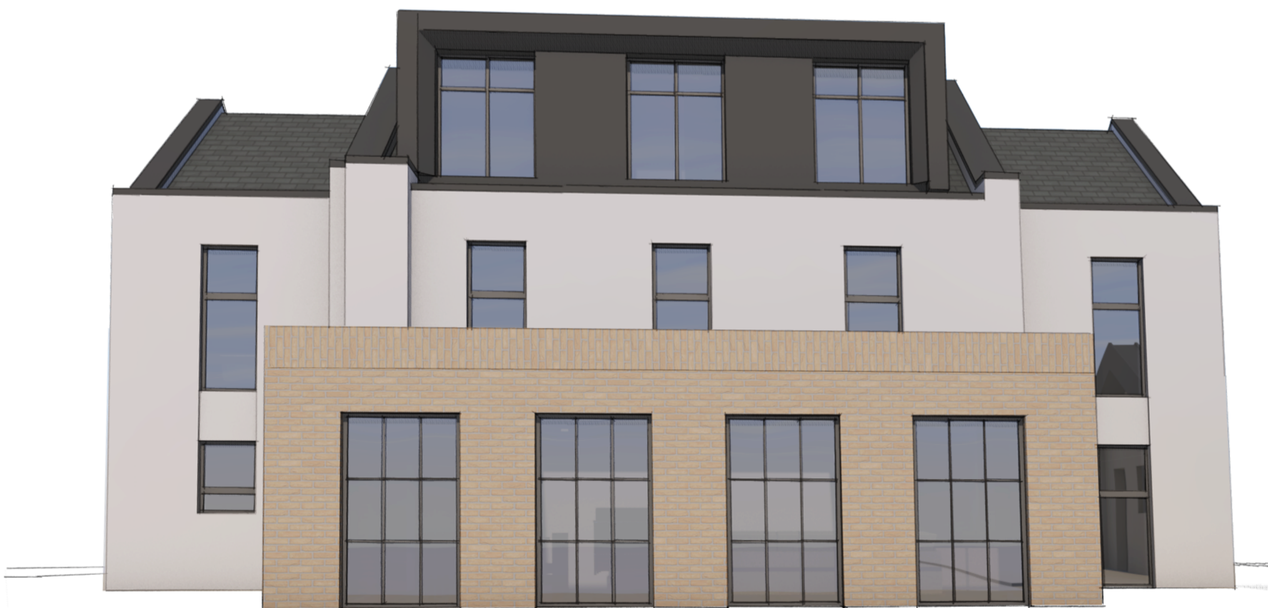
04 Sketch 4 Rear Elevation