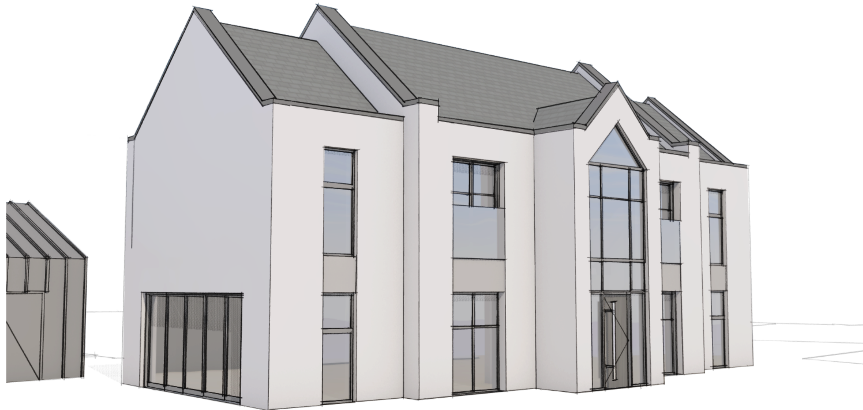
03 Sketch 3 Front/Side Elevation