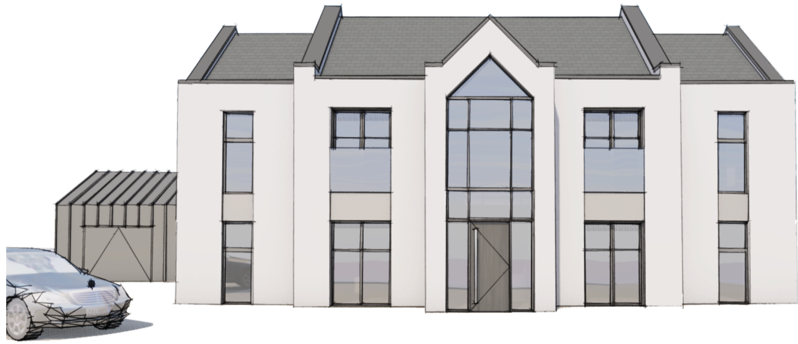
01 Sketch 1 Front Elevation