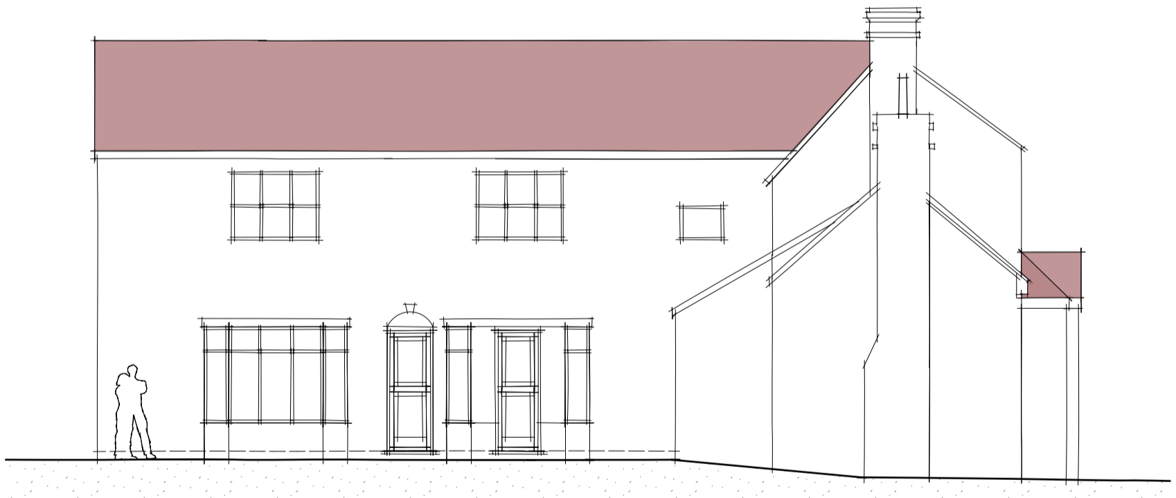
SIDE ELEVATION AS PROPOSED Scale 1:100 @ A1