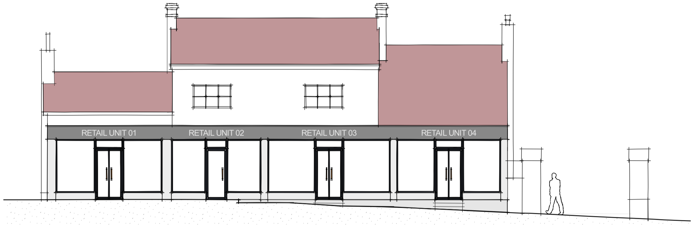
FRONT ELEVATION AS PROPOSED Scale 1:100 @ A1

NOTE: the client is advised of their duty under the party wall act 1996 to serve notice upon their neighbours minimum 2 months prior to any construction work on site. the Architect is the "author and owner" such that the architect retains all rights, including copyrights, to these documents