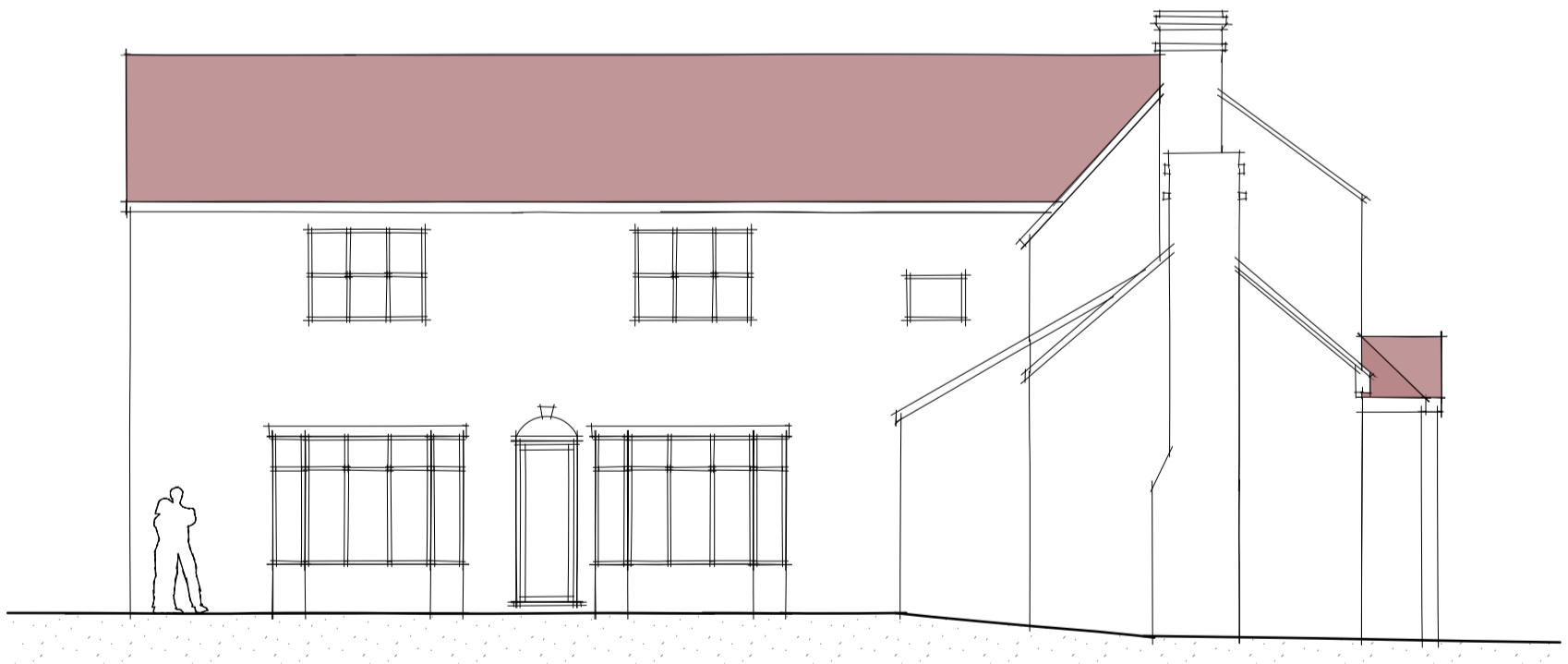
SIDE ELEVATION AS EXISTING Scale 1:100 @ A1