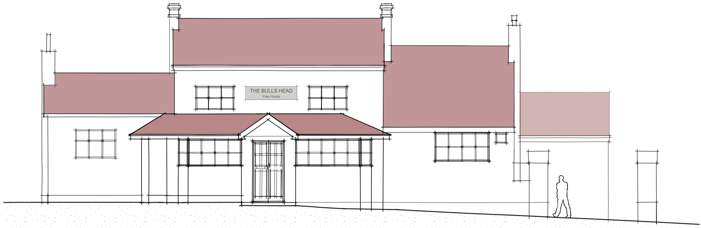
FRONT ELEVATION AS EXISTING Scale 1:100 @ A1

the Architect is the "author and owner" such that the architect retains all rights, including copyrights, to these documents