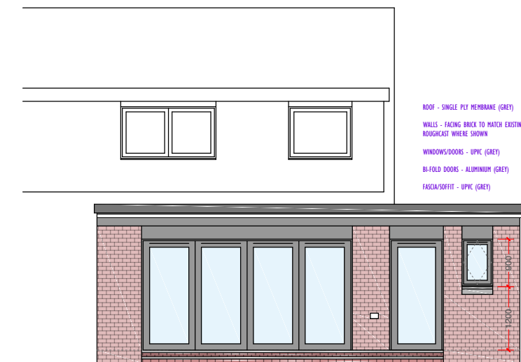
Proposed Rear Elevations (scale 1:100)