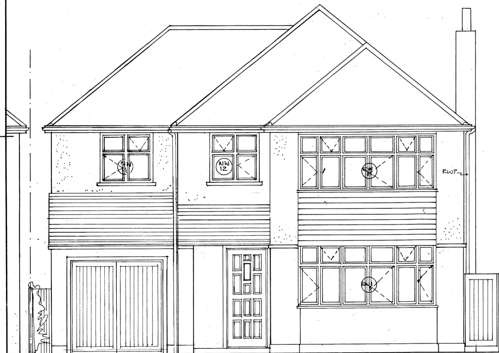
FRONT ELEVATION - NORTH