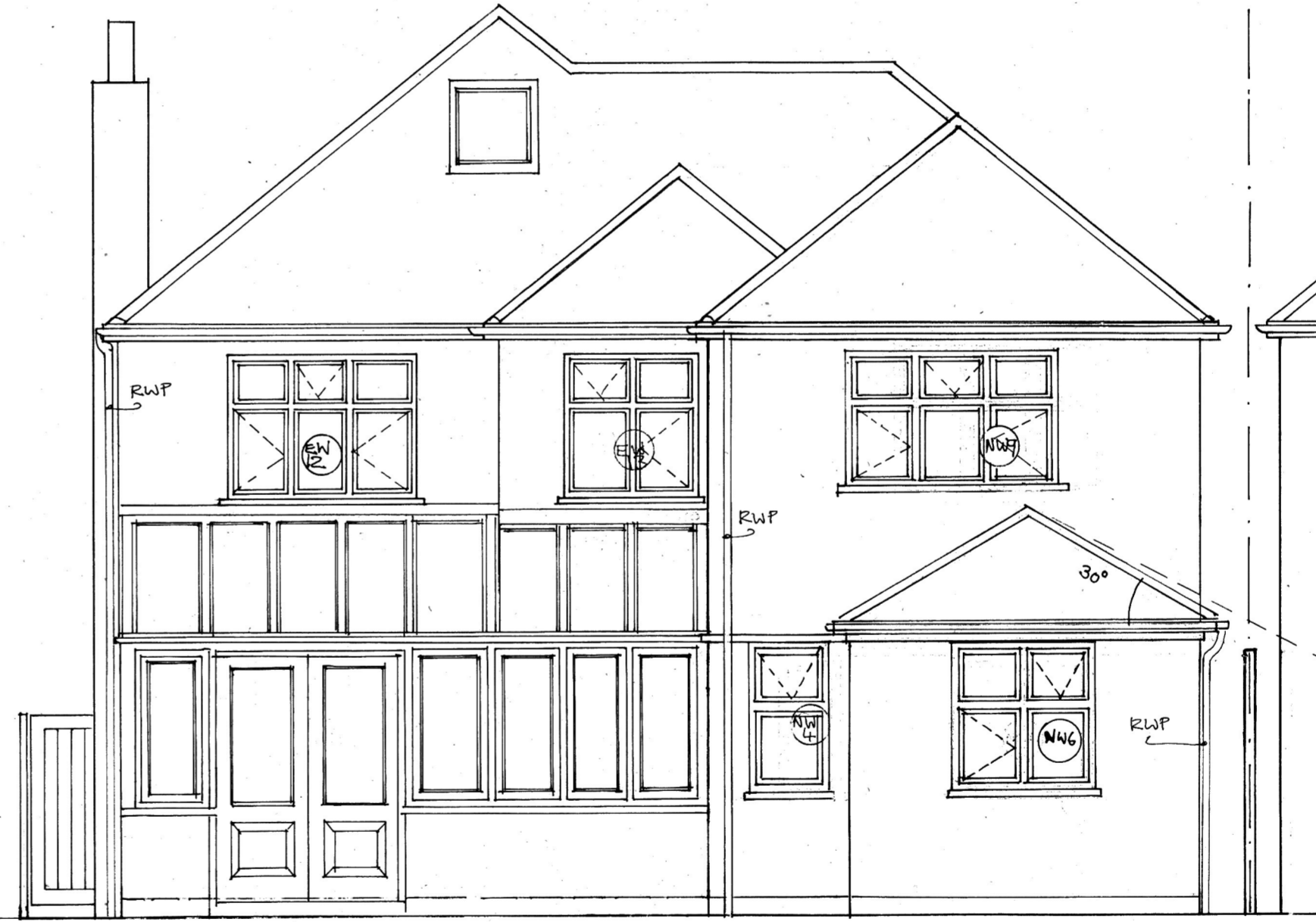
REAR ELEVATION - SOUTH