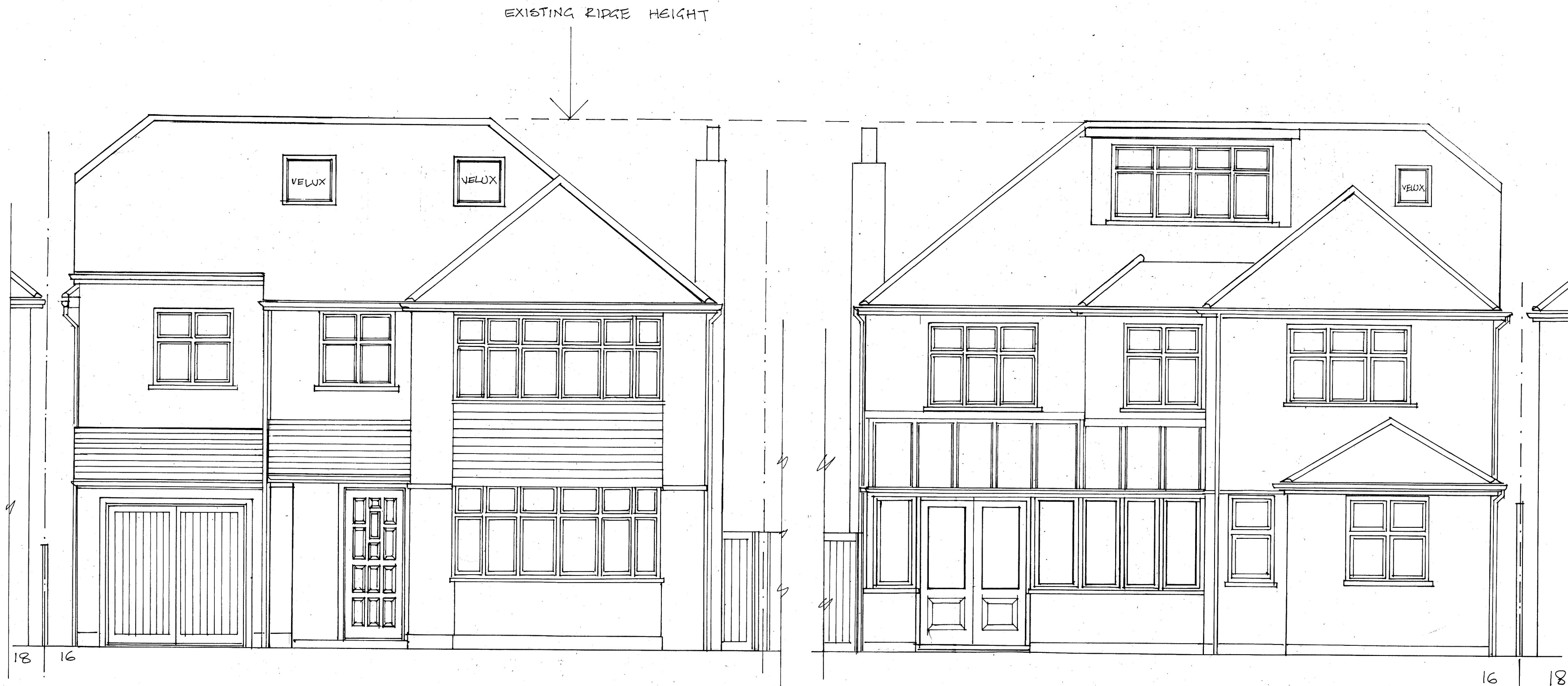
FRONT - NORTH ELEVATION

Notes: All dimensions must be checked on site and not scaled from this drawing.