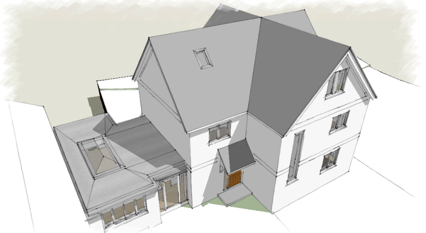
Front Birds Eye View