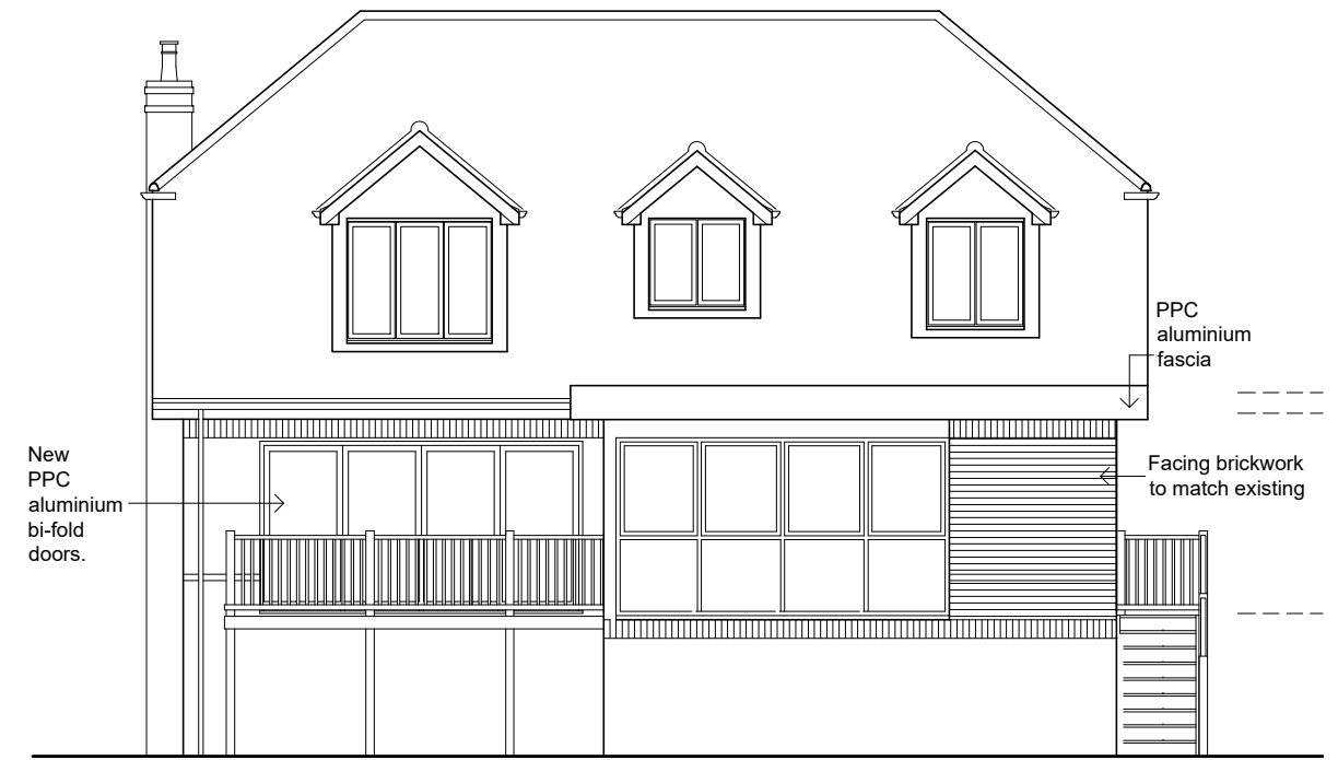
Rear (West) Elevation

NOTES: THIS DRAWING IS COPYRIGHT AND MUST NOT BE REPRODUCED WHOLLY OR IN PART WITHOUT PRIOR PERMISSION. THIS DRAWING IS TO BE READ IN CONJUNCTION WITH ALL RELEVANT DRAWINGS AND DOCUMENTS ISSUED BY THOMPSON BRADFORD ARCHITECTS Ltd & OTHER CONSULTANTS