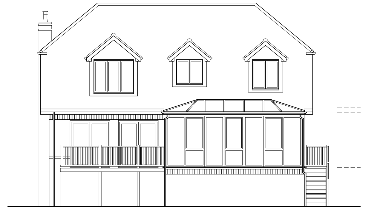
Rear (West) Elevation as Existing

NOTES: THIS DRAWING IS COPYRIGHT AND MUST NOT BE REPRODUCED WHOLLY OR IN PART WITHOUT PRIOR PERMISSION. THIS DRAWING IS TO BE READ IN CONJUNCTION WITH ALL RELEVANT DRAWINGS AND DOCUMENTS ISSUED BY THOMPSON BRADFORD ARCHITECTS Ltd & OTHER CONSULTANTS