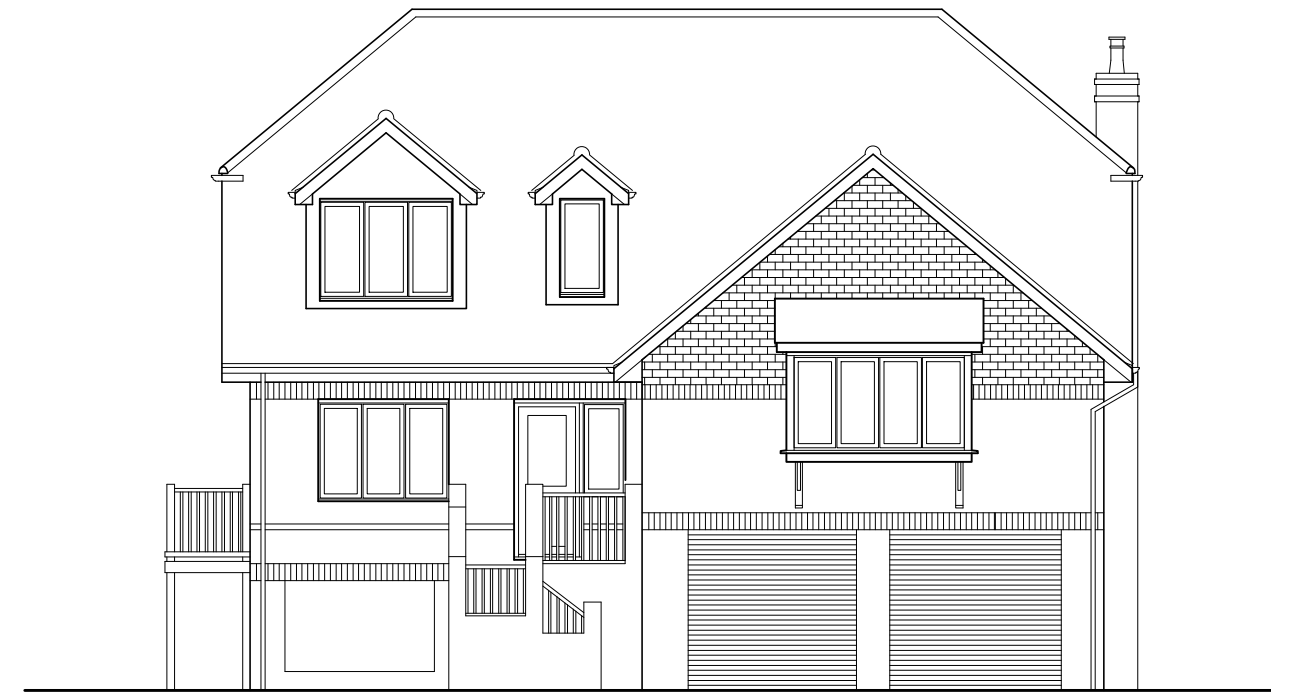
Front (East) Elevation as Existing