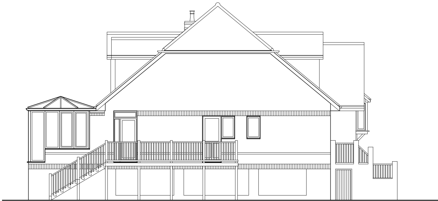
Side (South) Elevation as Existing