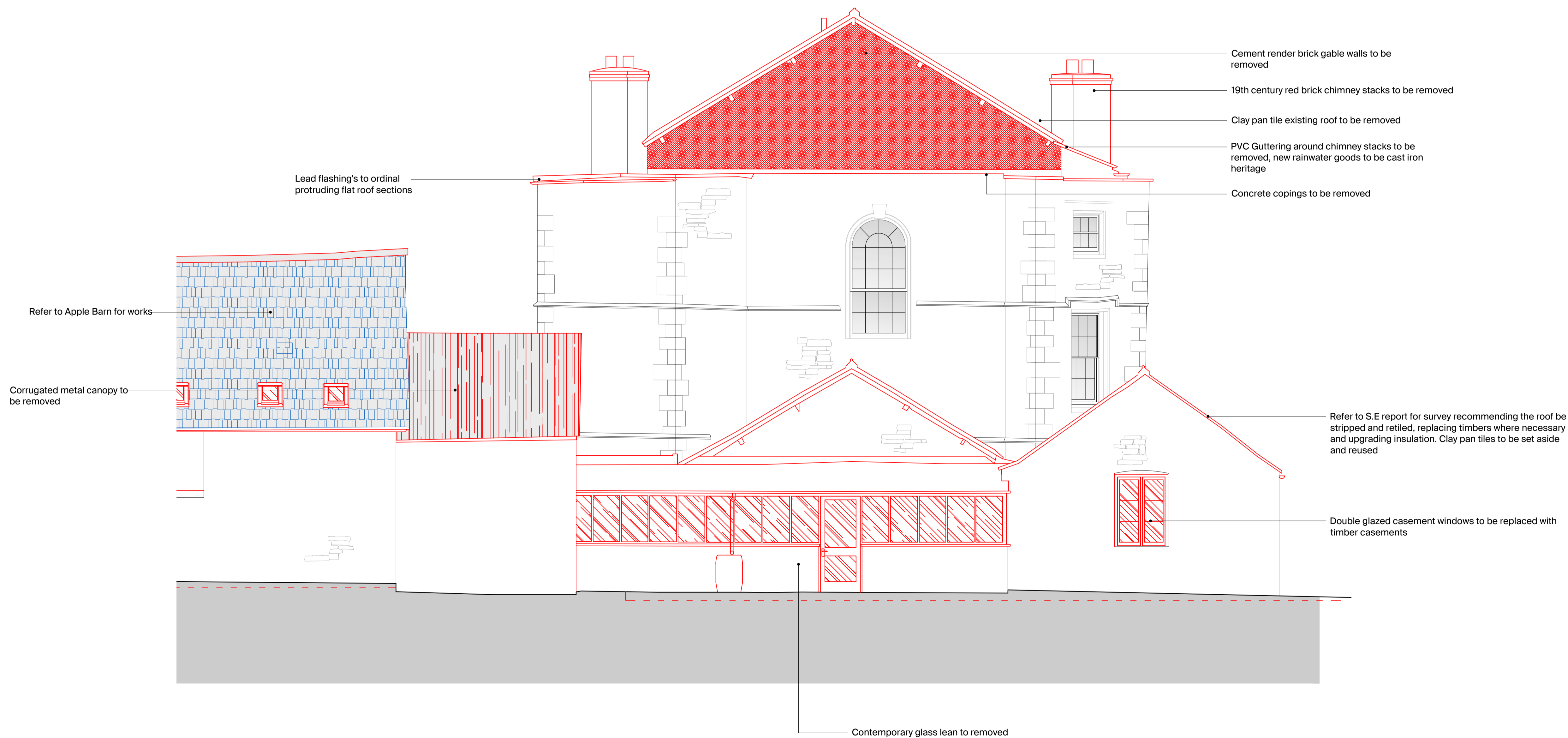
01 Demolition North Elevation - Main House 1:50@A1, 1:100@A3

TOWN The People's Hall Studio 5, 2 Olaf Street London W11 4BE