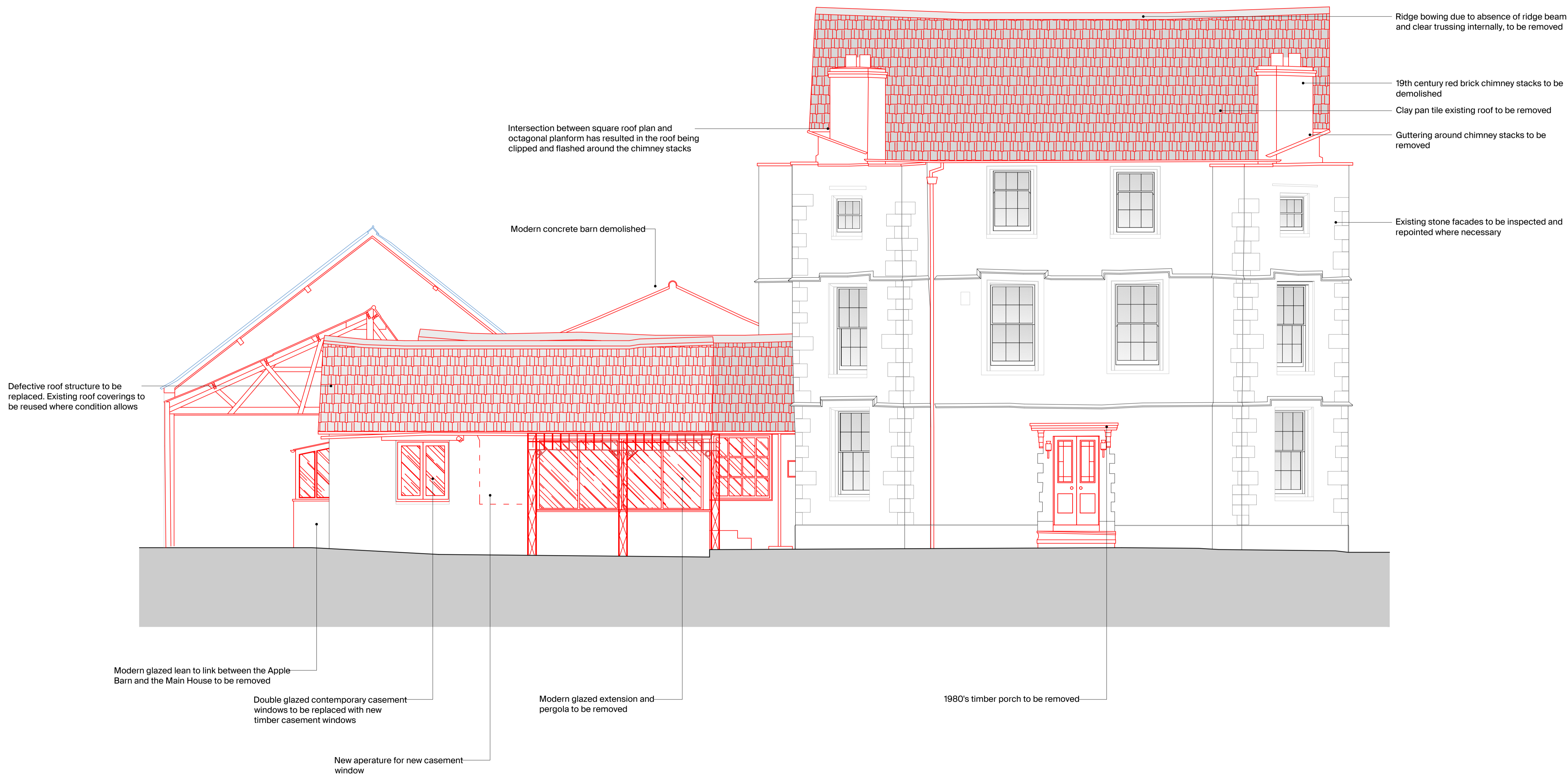
06 Demolition West Elevation 1:50@A1, 1:100@A3

TOWN The People's Hall Studio 5, 2 Olaf Street London W11 4BE