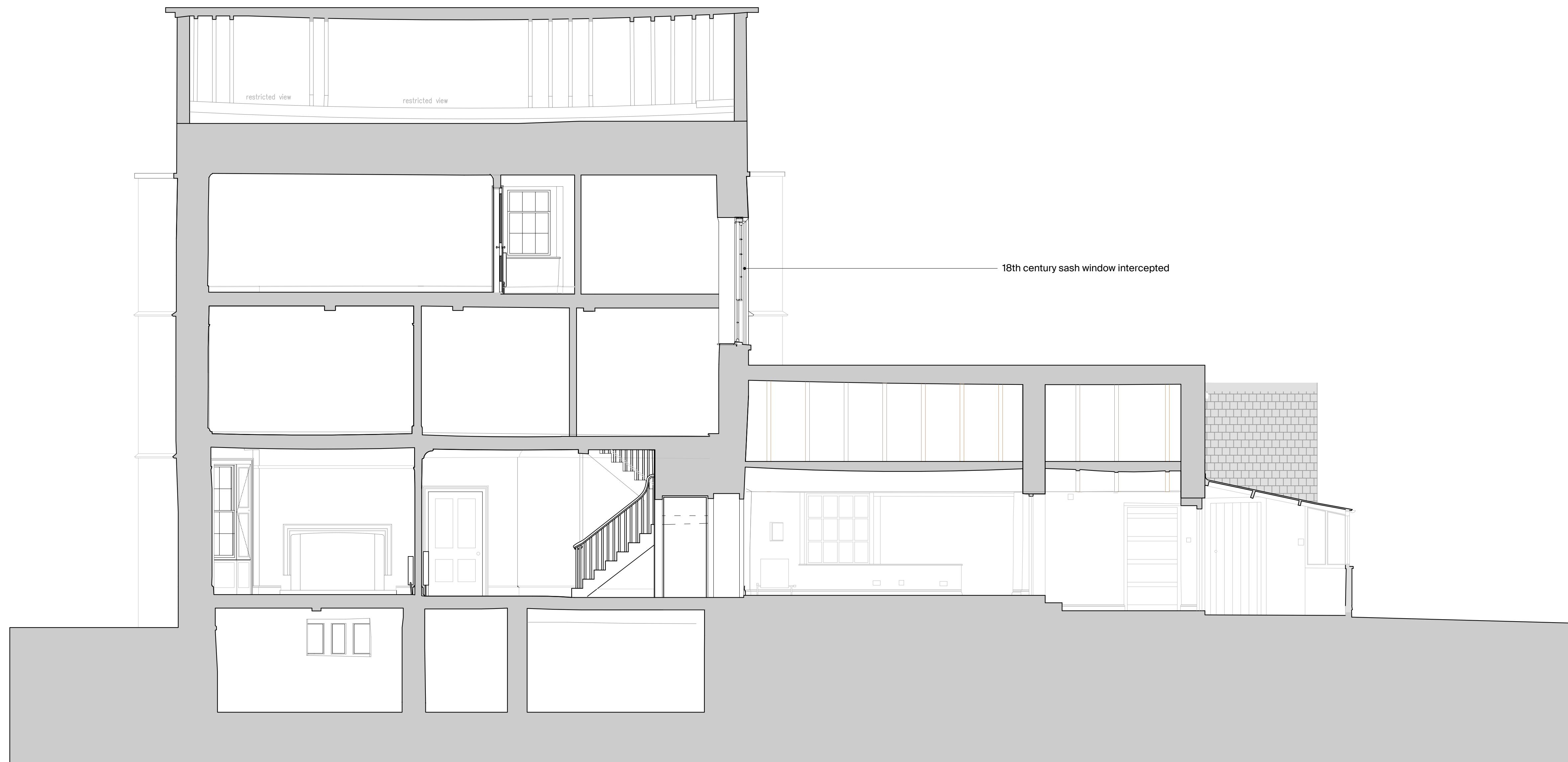
01 Existing Section A-A 1:50@A1, 1:100@A3

TOWN The People's Hall Studio 5, 2 Olaf Street London W11 4BE