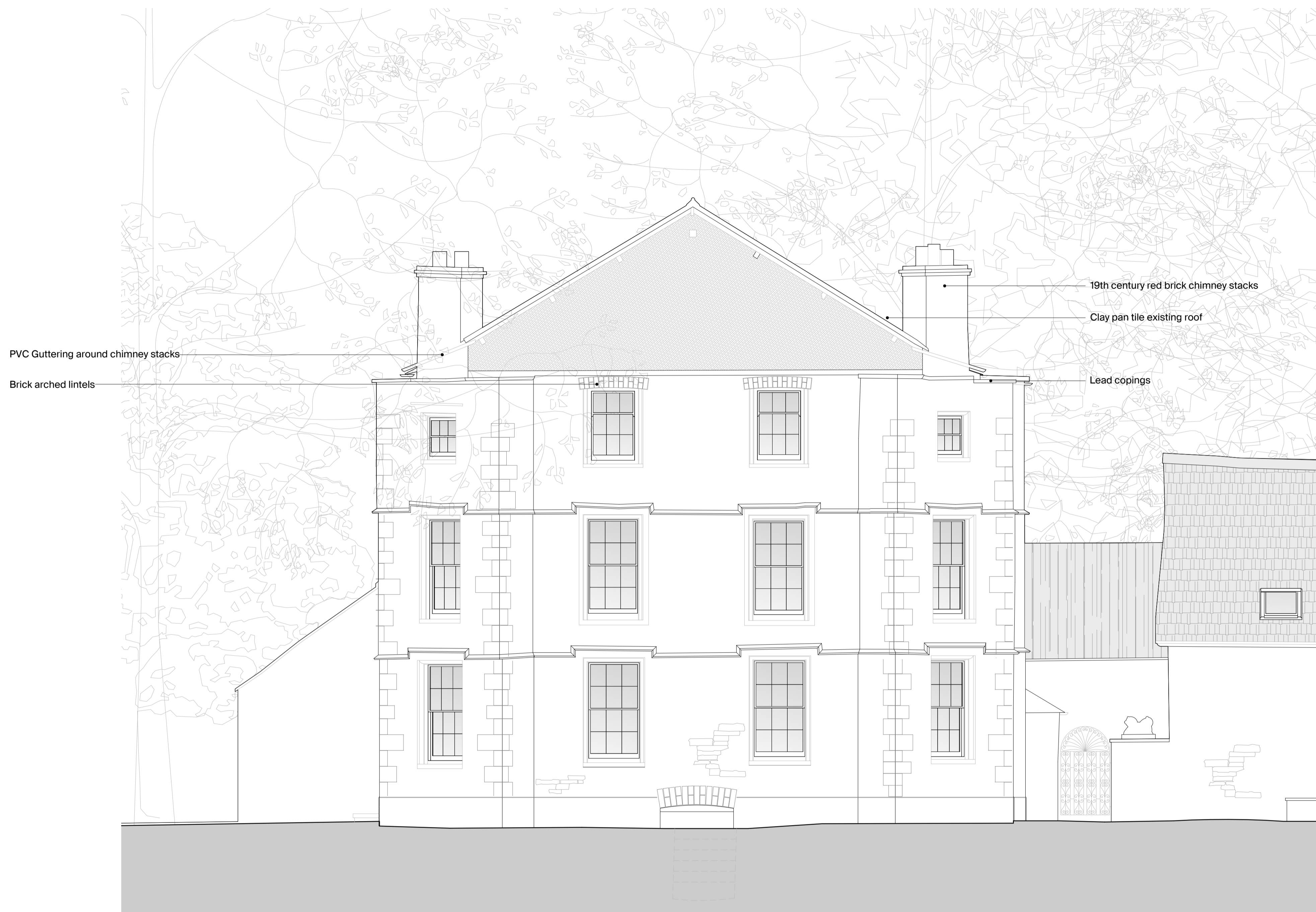
04 Existing South Elevation - Main House 1:50@A1, 1:100@A3

TOWN The People's Hall Studio 5, 2 Olaf Street London W11 4BE