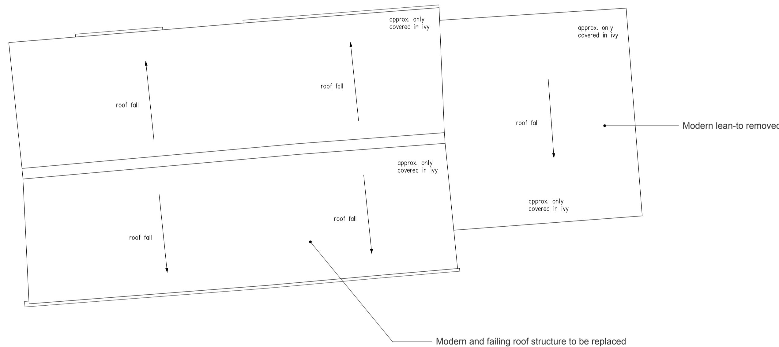
01 Existing Roof Plan 1:50@A1, 1:100@A3