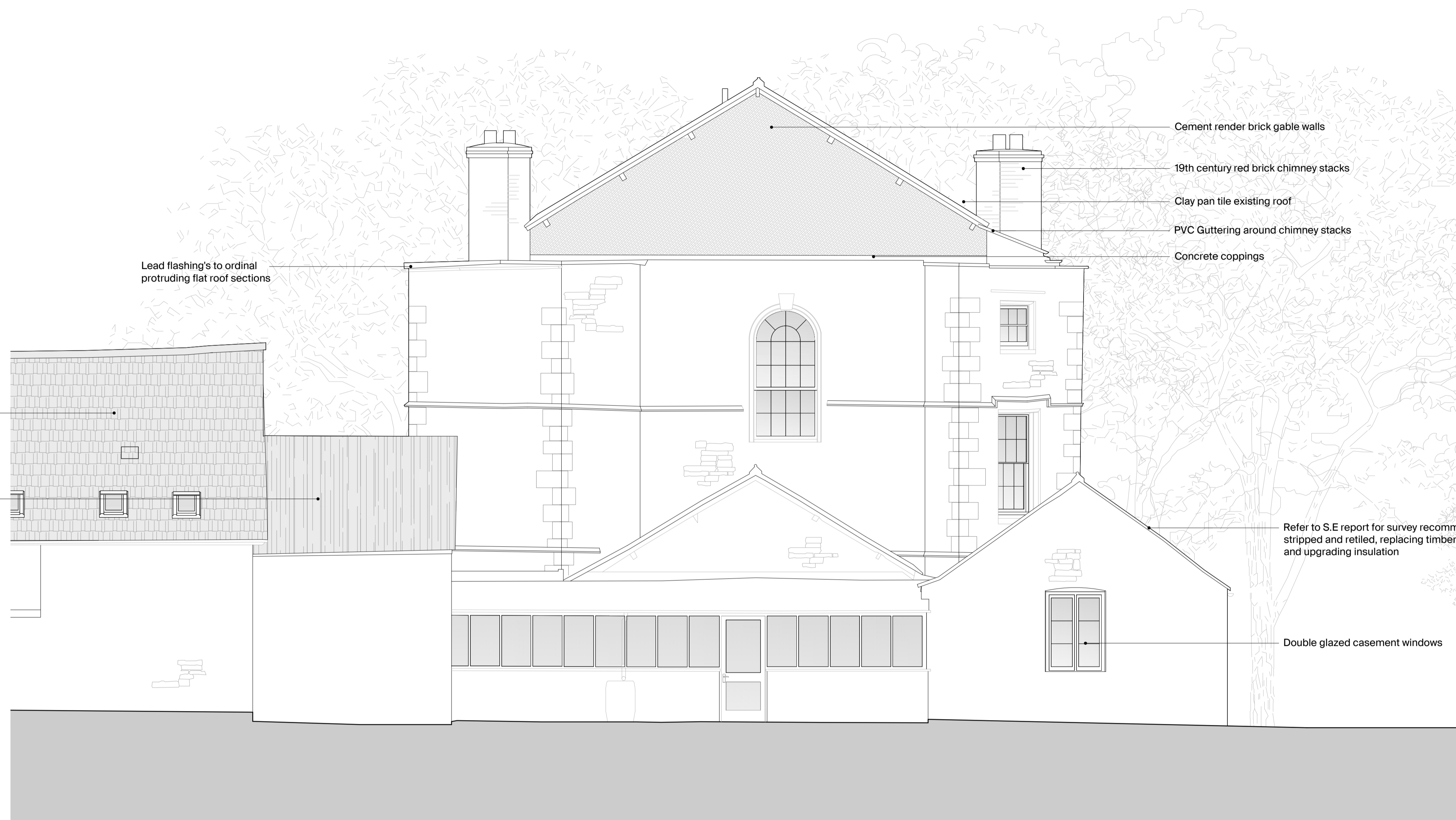
01 Existing North Elevation - Main House 1:50@A1, 1:100@A3

TOWN The People's Hall Studio 5, 2 Olaf Street London W11 4BE