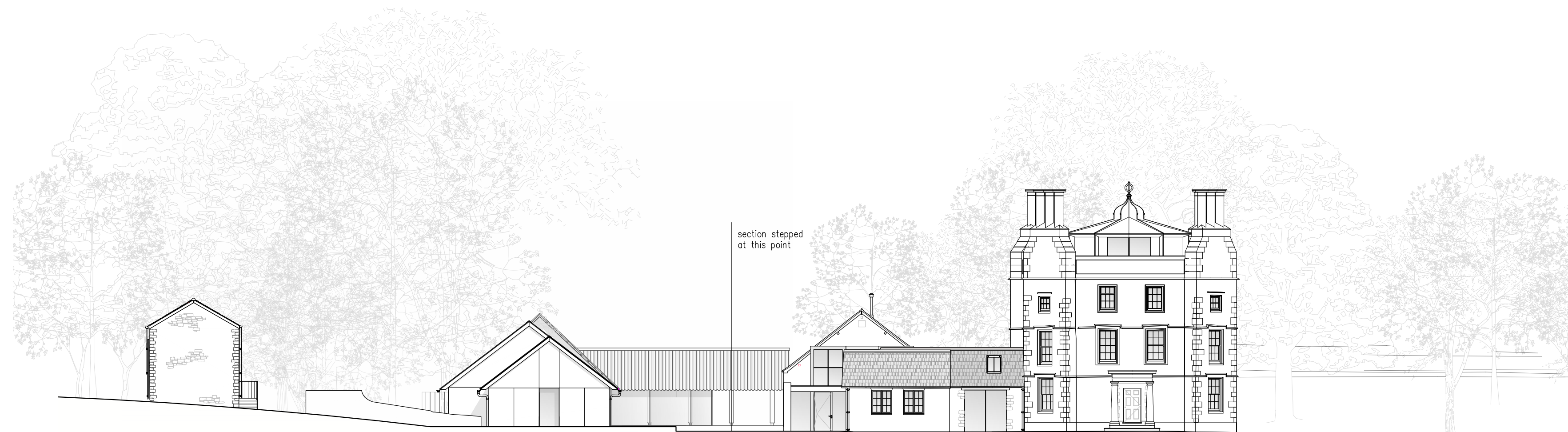
02 Proposed Site Section Y-Y 1:200@A1, 1:400@A3