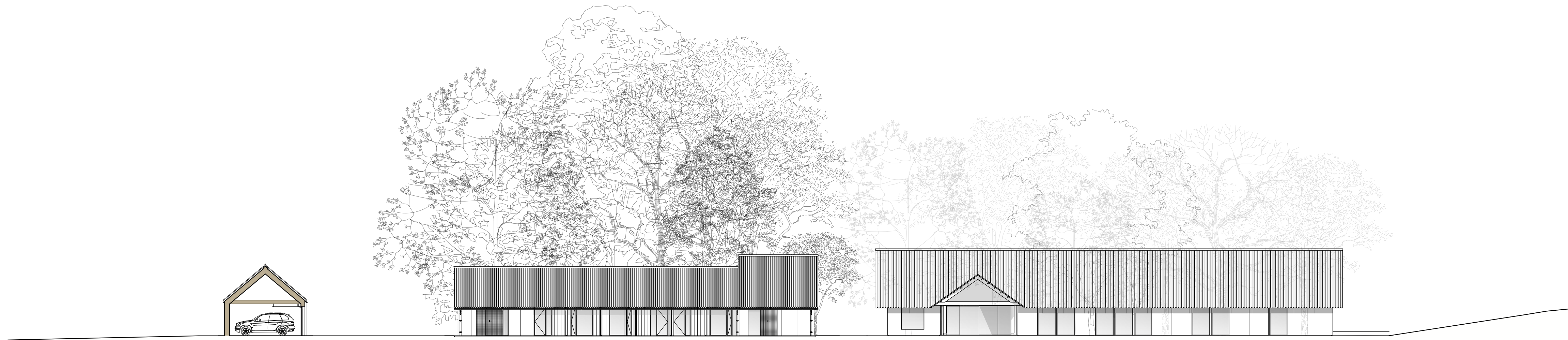
01 Proposed Site Section X-X 1:200@A1, 1:400@A3

TOWN The People's Hall Studio 5, 2 Olaf Street London W11 4BE