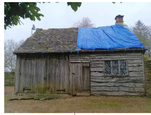
Existing garage lined with blockwork and plasterboard housing main house boiler and storage to be carefully dismantled and removed. Refer to drawing 1000.