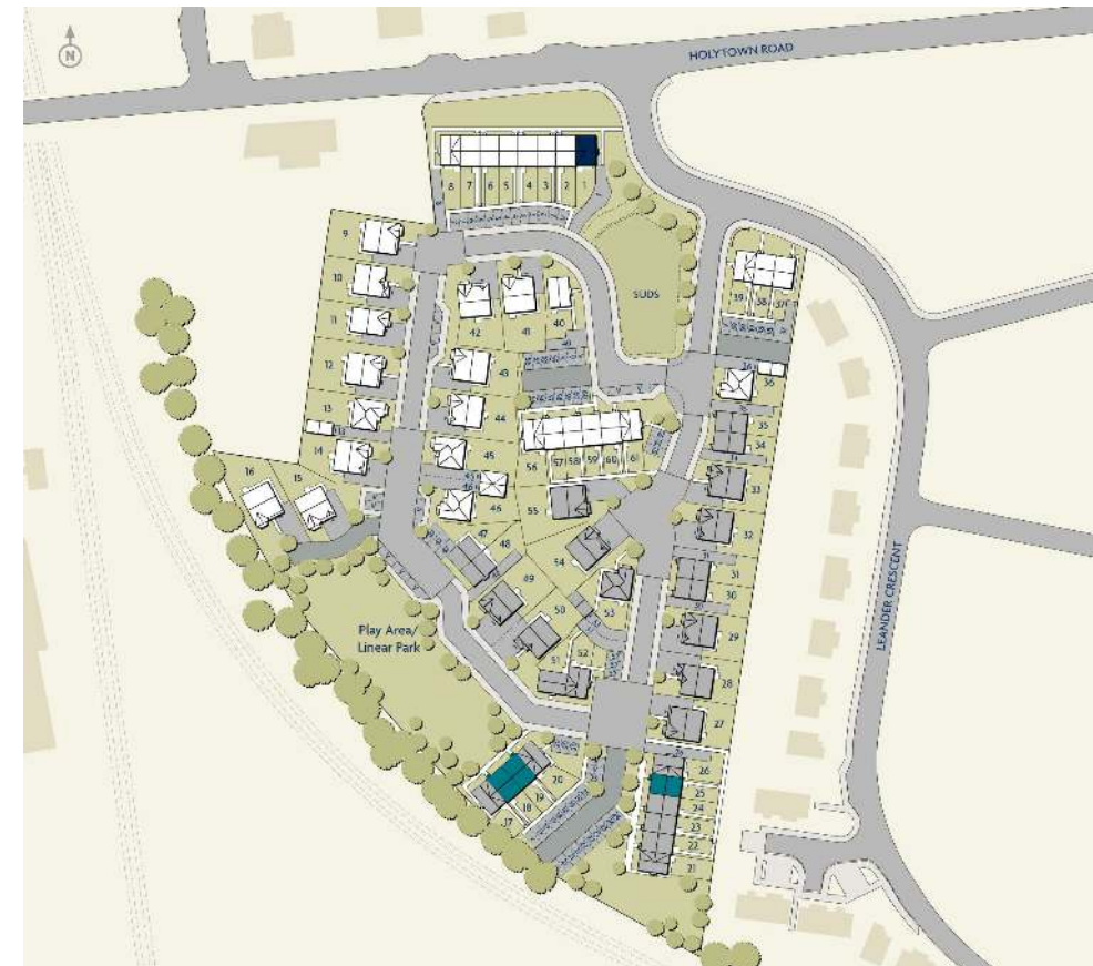
1 Plan 1 : 2500